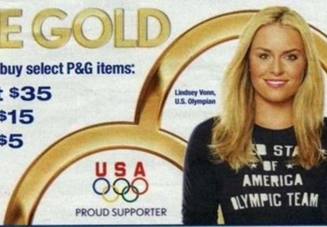
Lindsey Vonn, U.S. Olympian

©2010 P&G P&G, Proud Sponsor of the U.S. Olympic Team. 36-USC-220506. Cards are issued by Citibank, N.A. pursuant to a license from Visa U.S.A. Inc. and managed by Cit Prepaid Services. Cards will not have cash access and can be used everywhere Visa debit cards are accepted.