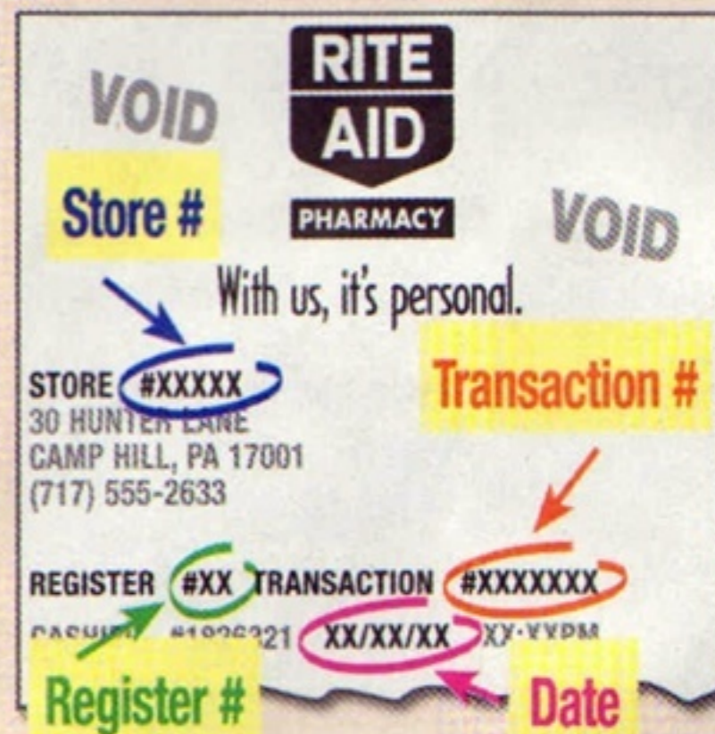
Sample Rite Aid Register Receipt