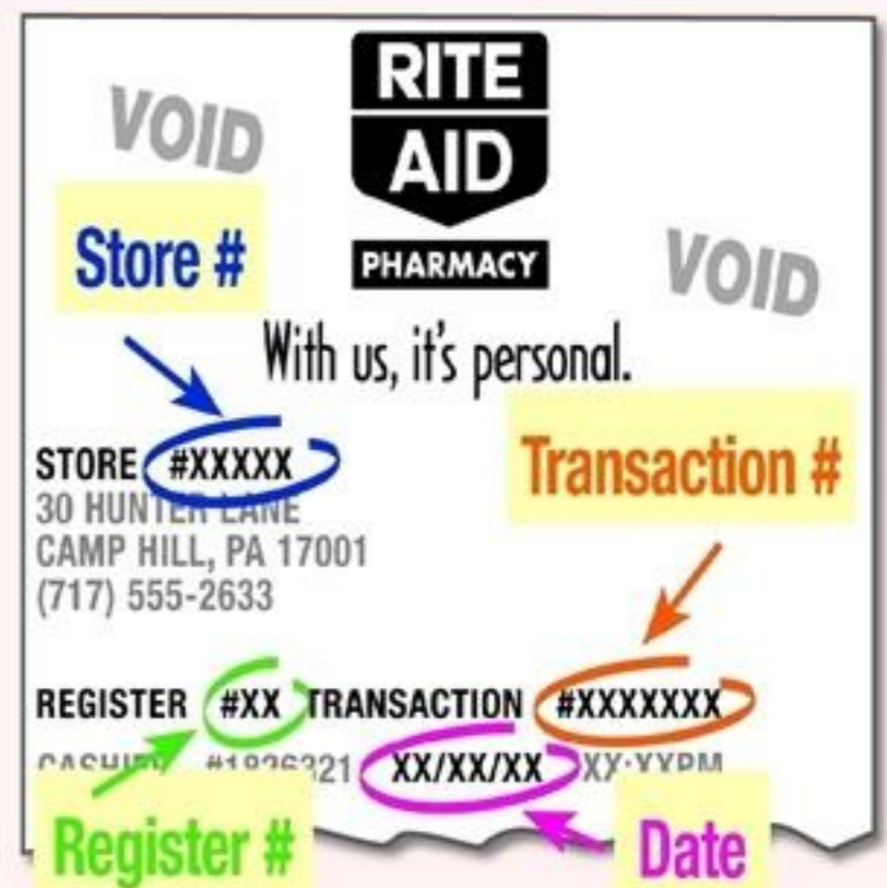
Sample Rite Aid Register Receipt