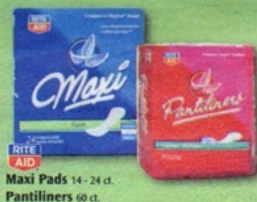
Maxi Pads 14 - 24 ct. Pantliners 60 ct.

BUY ONE GET SECOND ONE FREE of equal or lesser value plus applicable sales tax. Items offered at regular retail. WITH WELLNESS+ CARD