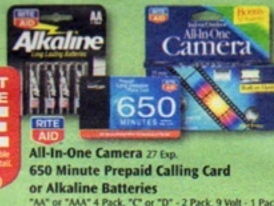
All-In-One Camera 27 Exp. 650 Minute Prepaid Calling Card or Alkaline Batteries "AA" or "AAA" 4 Pack, "C" or "D" - 2 Pack, 9 Volt - 1 Pack

BUY ONE GET SECOND ONE FREE of equal or lesser value plus applicable sales tax. Items offered at regular retail. WITH WELLNESS+ CARD