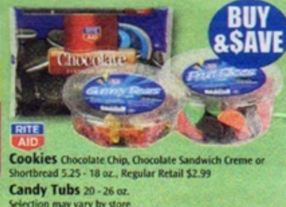
Cookies Chocolate Chip, Chocolate Sandwich Creme or Shortbread 5.25 - 18 oz., Regular Retail $2.99 Candy Tubs 20 - 26 oz. Selection may vary by store