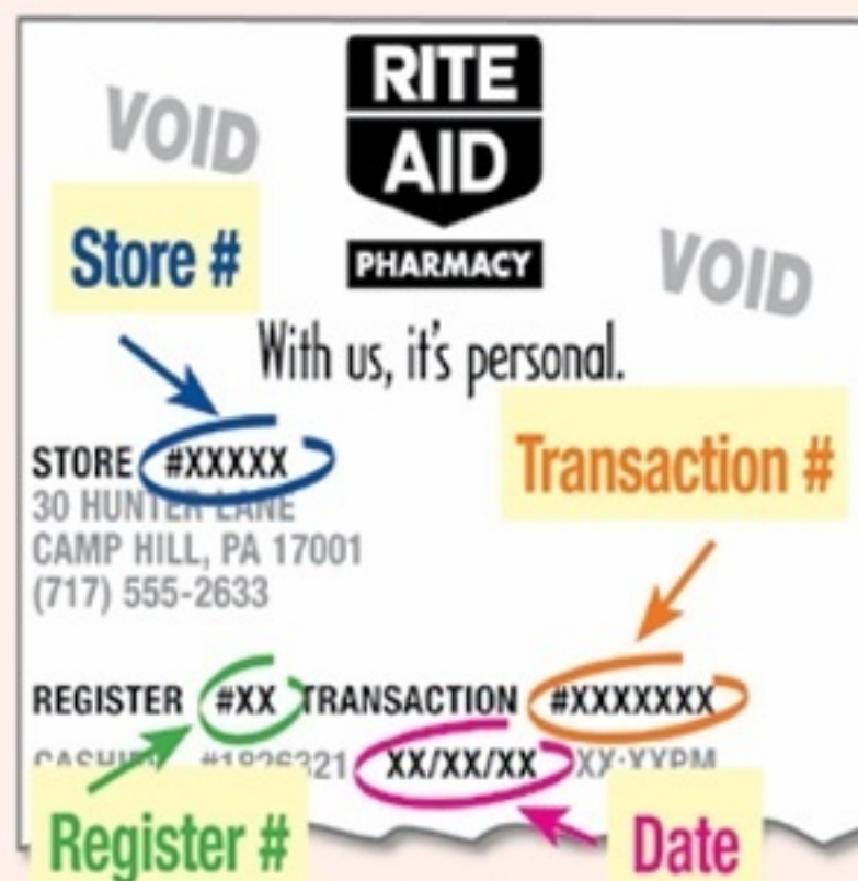
Sample Rite Aid Register Receipt