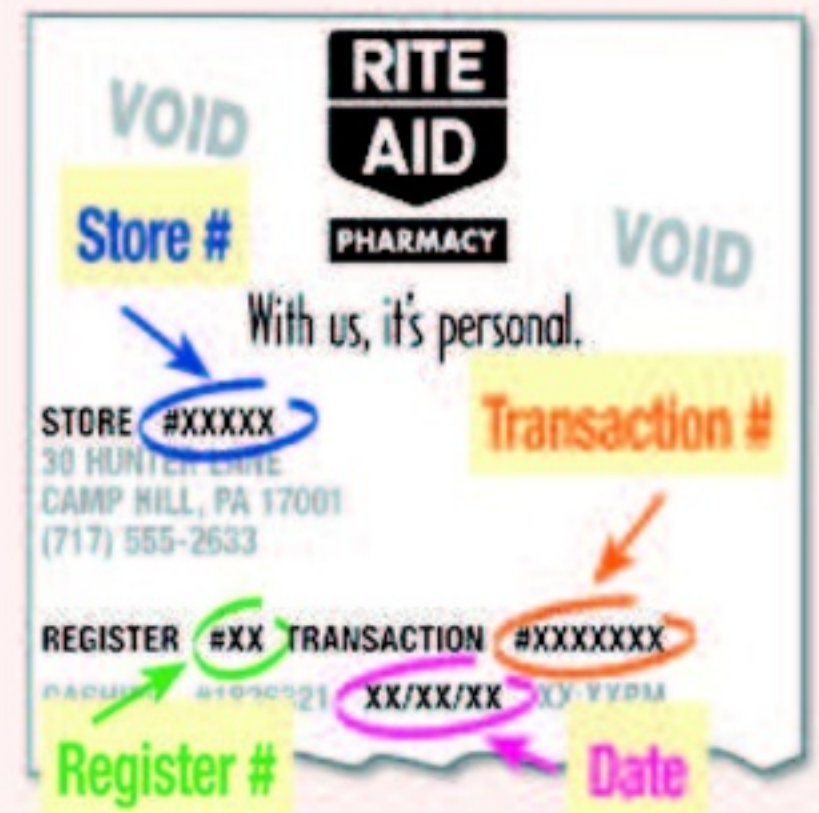
Sample Rite Aid Register Receipt