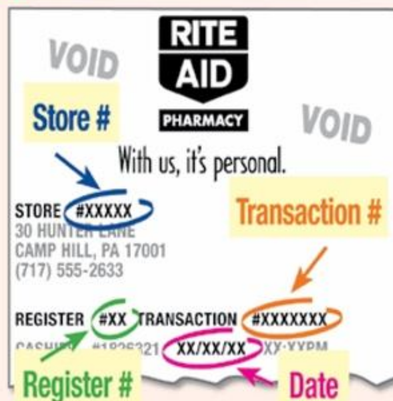
Sample Rite Aid Register Receipt