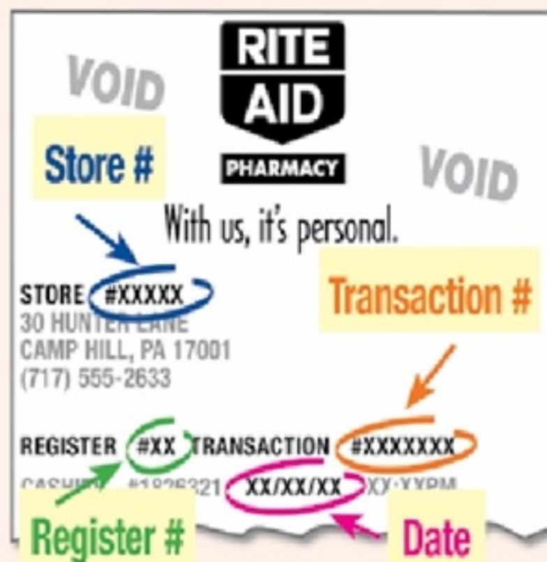
Sample Rite Aid Register Receipt