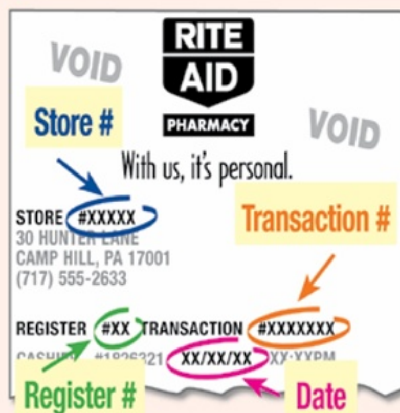
Sample Rite Aid Register Receipt