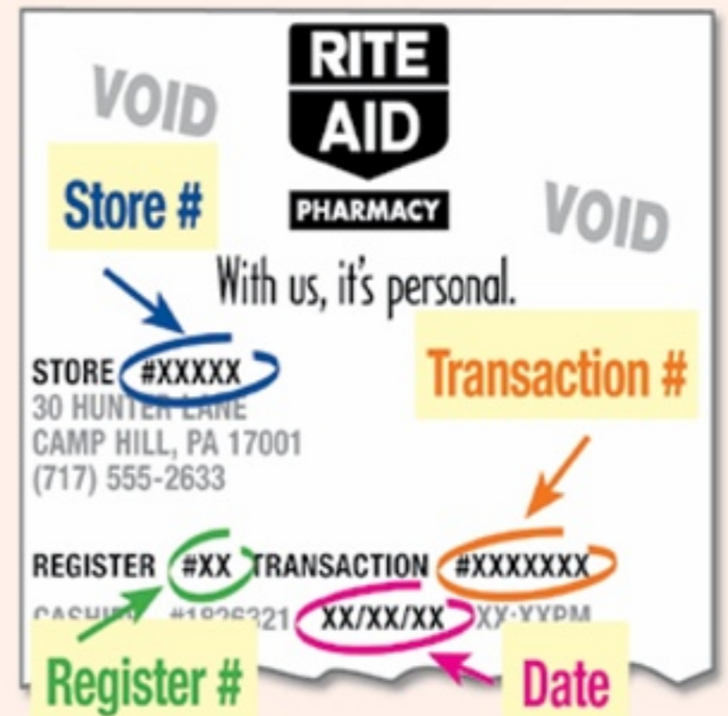
Sample Rite Aid Register Receipt