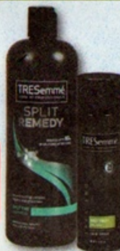
TRESemme Shampoo, Conditioner or Stylers

BUY ANY 2 OF THESE ITEMS AND GET $1 +UP REWARD FOR NEXT PURCHASE