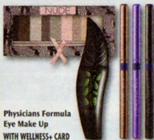
Physicians Formula Eye Make Up WITH WELLNESS+ CARD

BUY ANY OF THESE ITEMS AND GET $4 +UP REWARD FOR NEXT PURCHASE