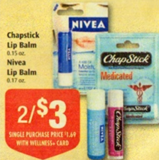
Chapstick Lip Balm 0.15 oz. Nivea Lip Balm 0.17 oz.