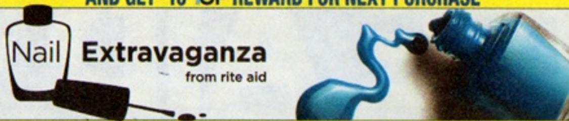
Nail Extravaganza from rite aid

BUY $30 OF ANY NAIL POLISH OR NAIL ART AND GET $10 +UP REWARD FOR NEXT PURCHASE