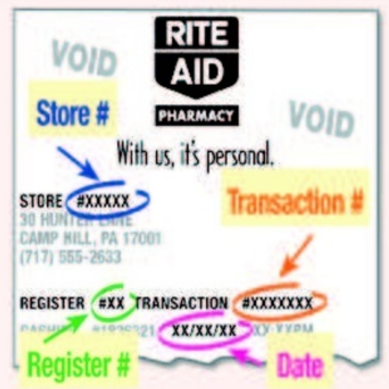
Sample Rite Aid Register Receipt