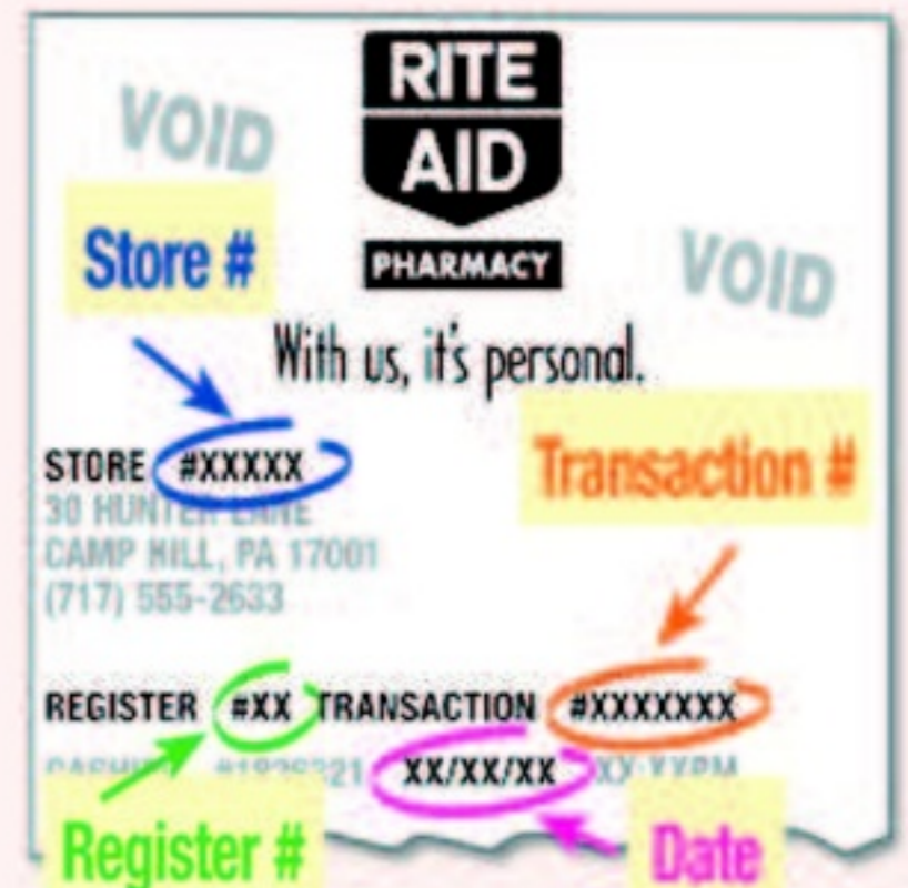
Sample Rite Aid Register Receipt