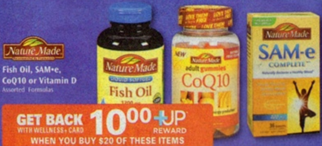
Nature Made Fish Oil, SAM-e, CoQ10 or Vitamin D Assorted Formulas

GET BACK 10 00 +UP WITH WELLNESS+ CARD REWARD WHEN YOU BUY $20 OF THESE ITEMS