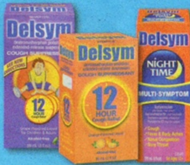
Delsym Children or Adult 3 - 4 oz.