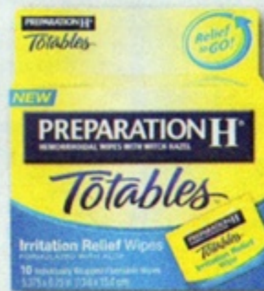
Preparation H Totentable Wipes 10 ct.

*DISCOUNT ONLY - NOT INSURANCE. Certain limitations apply, including covered generic drugs. See the pharmacy for details.