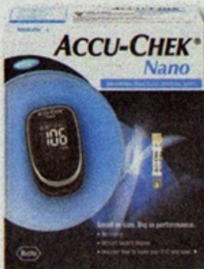
Accu-Chek Nano Meter Kit

10 00 OFF REGULAR RETAIL WITH WELLNESS+ CARD