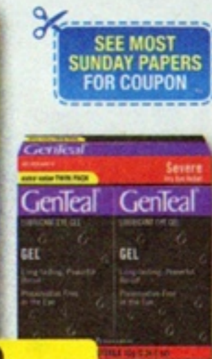
Opti-Free Express, Replenish Multi-Purpose Solutions Twin Pack 2 Pack 10 oz. Systane Ultra Twin Pack and 30 ml. GenTeal Twin Pack, gel and 25 ml.