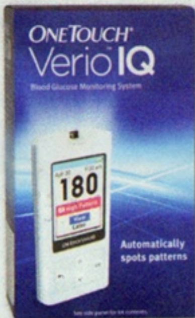
Verio IQ Meter 19 99 WITH WELLNESS+ CARD