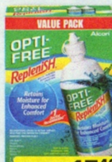
YOU PAY 15 49 WITH WELLNESS+ CARD

GET BACK 5 00 +JP REWARD WHEN YOU BUY $25 OF THESE ITEMS