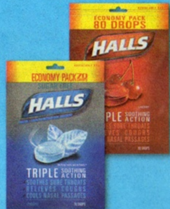
2/$7 SINGLE PURCHASE PRICE $3.99 WITH WELLNESS+ CARD Halls Cough Drops 70 - 80 ct.

YOU PAY 14 99 WITH WELLNESS+ CARD GET BACK 2 00 +JP REWARD