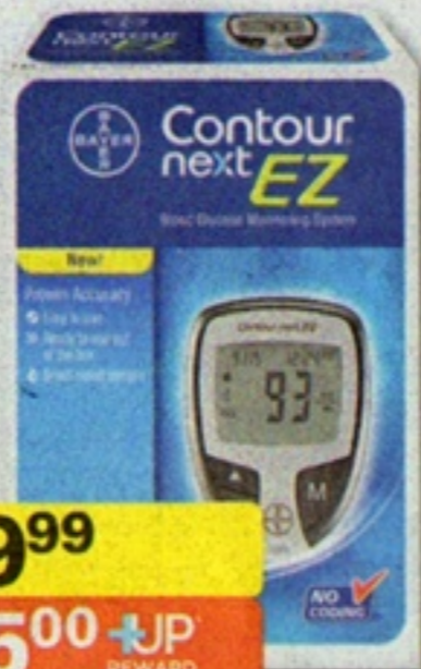
Bayer Contour Next EZ Meter

YOU PAY 9 99 WITH WELLNESS+ CARD GET BACK 5 00 +UP REWARD