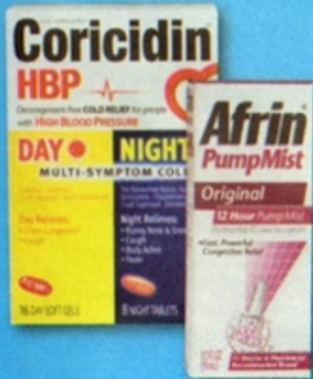
Afrin Nasal Spray 15 ml. Coricidin Cold Relief Tablets 16 - 24 ct. or Liquid 10 oz.

YOU PAY 6 99 WITH WELLNESS+ CARD GET BACK 1 00 +JP REWARD