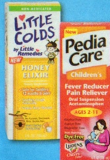
3 99 WITH WELLNESS+ CARD Pedia Care Cold and Fever Relievers or Little Colds Liquid 4 oz.