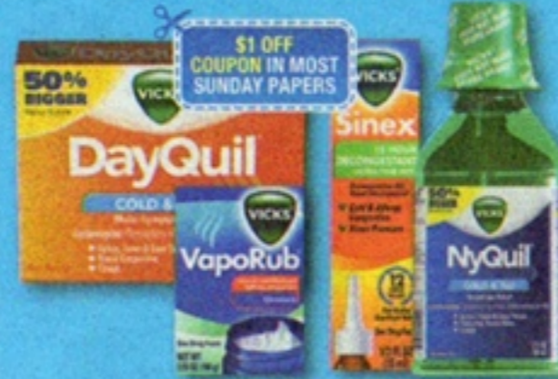
Vicks NyQuil or DayQuil Adult Liquid 12 oz. or Liquicaps 24 ct., Children's Liquid 8 oz. Vicks Nature Fusion Liquid 8 oz. or Liquicaps 20 ct. Vicks Vaporub 5 - 100 Grams Sinex Nasal Spray 0.5 oz.