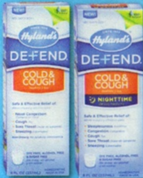
Hyland's Defend Cold Relief 8 oz.

YOU PAY 9 99 WITH WELLNESS+ CARD GET BACK 5 00 +JP REWARD