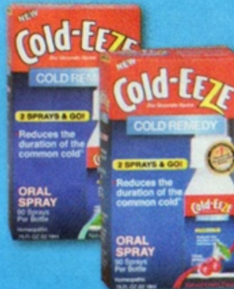
Cold-Eeze Oral Spray 0.75 oz., Day/Night Cold Relief 24 ct.

YOU PAY 9 99 WITH WELLNESS+ CARD GET BACK 5 00 +JP REWARD