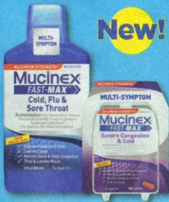
Mucinex Fast-Max Liquid 9 oz. or Caplets 30 ct.