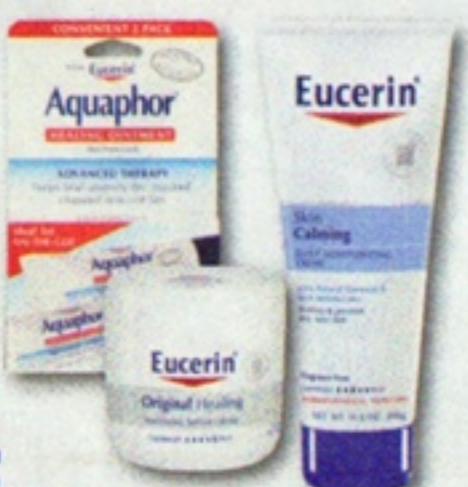
All Eucerin and Aquaphor Skin Care and Baby Care