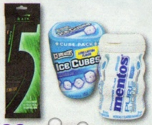
Gum or Mint Multipacks 40-80 ct. Choose from Wrigley's 5, Orbit Mint, Trident Xtra Care or Layers, Stride Spark or Shaun White, T.D., Breath Savers, Mentos or Tic Tacs