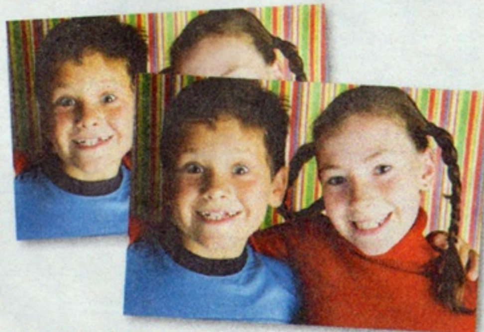
Photo Coupon / Expires 12/08/12

Digital Prints BUY 20 GET 20 FREE NO LIMIT PLUS APPLICABLE SALES TAX WITH WELLNESS+ CARD