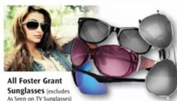
All Foster Grant Sunglasses (excludes As Seen on TV Sunglasses)

GET BACK 500 +UP REWARD WITH WELLNESS+ CARD WHEN YOU BUY 2 OF THESE ITEMS