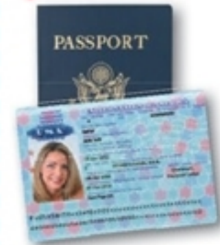
Photo Coupon / Expires 09/07/13

2 114988 100500 15 Must bring coupon to get advertised discount. Good only at RITE AID Pharmacies. Limit one per customer. Not valid if duplicated.