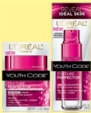
YOUTH CODE® Texture Perfector Day/Night Cream & Serum Concentrate

5.00 OFF REGULAR RETAIL WITH WELLNESS+ CARD