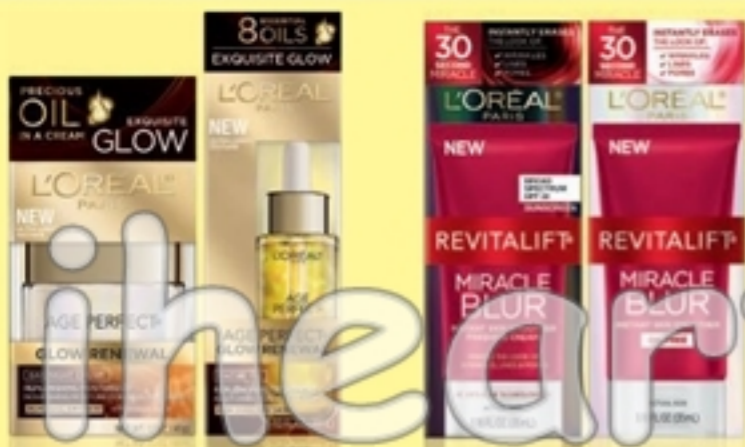
AGE PERFECT® Glow Renewal Day/Night Cream & Oil