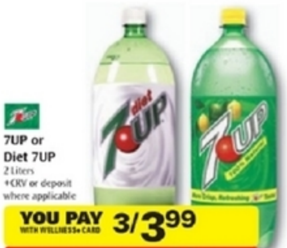
7UP or Diet 7UP 2 Liters +CRV or deposit where applicable

GET 5 00 +UP REWARD WHEN YOU BUY $24.99 OF XBOX MEMBERSHIP CARDS *Limit 2 +UP offers per household.