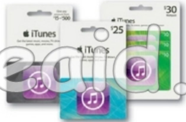
iTunes Gift Cards

GET 6 00 +UP REWARD WHEN YOU BUY $25 OF SELECT RESTAURANT GIFT CARDS *Limit 2 +UP offers per household.