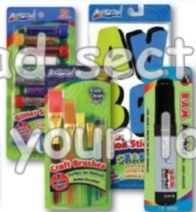
All Art Skills Arts and Crafts Items

GET 5 00 +UP REWARD WHEN YOU BUY $50 OF OLIVE GARDEN OR RED LOBSTER GIFT CARDS *Limit 2 +UP offers per household.