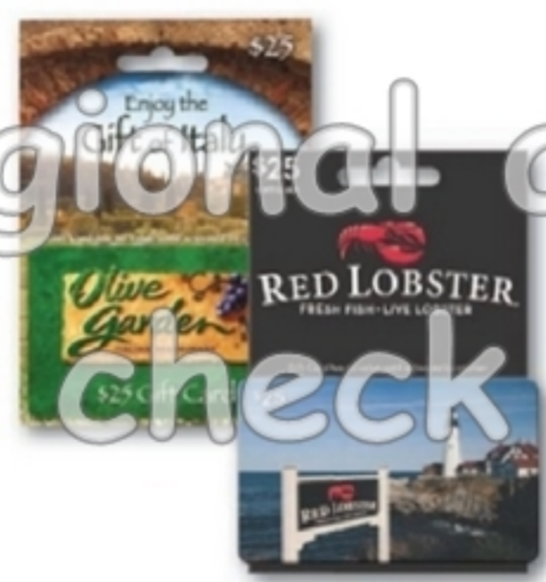
Olive Garden or Red Lobster Gift Cards

YOU PAY 2/2 00 WITH WELLNESS+ CARD SINGLE PURCHASE PRICE $1.19 GET 1 00 +UP REWARD WHEN YOU BUY 2 OF THESE ITEMS *Limit 4 +UP offers per household.