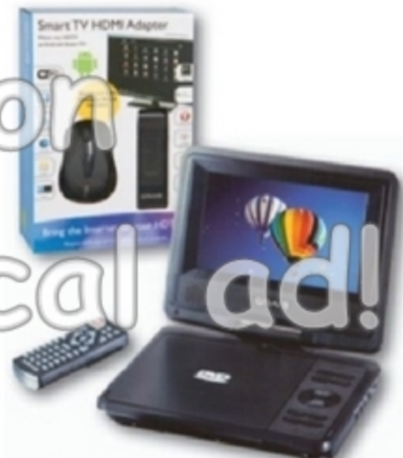
Craig Portable DVD 7" or Smart TV Adapter

GET 2 00 +UP REWARD WHEN YOU BUY $10 OF THESE ITEMS *Limit 2 +UP offers per household.