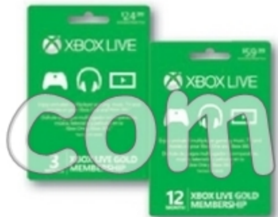
Xbox Membership Cards

GET 6 00 +UP REWARD WHEN YOU BUY $25 OF ITUNES GIFT CARDS *Limit 2 +UP offers per household.