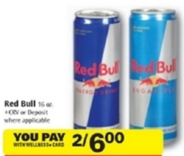
Red Bull 16 oz. +CRV or Deposit where applicable

YOU PAY 3/3 00 WITH WELLNESS+ CARD GET 1 00 +UP REWARD WHEN YOU BUY 3 OF THESE ITEMS *Limit 2 +UP offers per household.