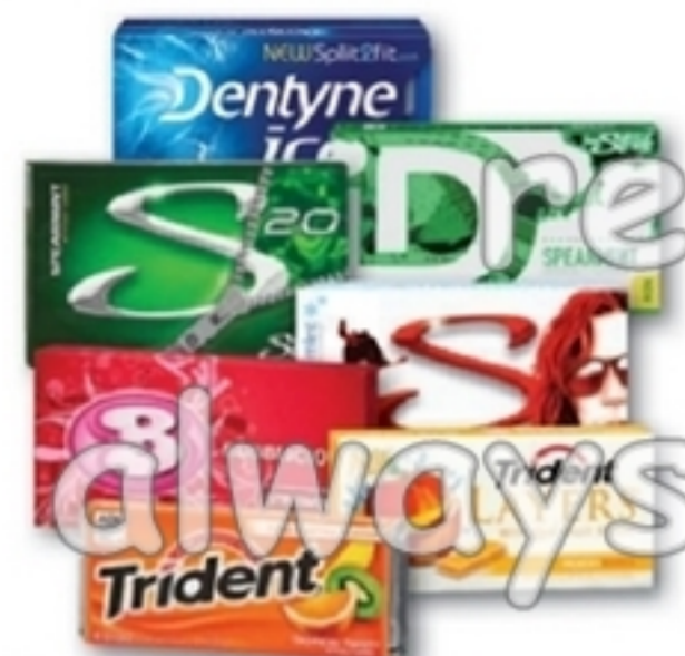
All Cadbury Gum Regular Retail $1.29 - $1.69

YOU PAY 2/2 00 WITH WELLNESS+ CARD SINGLE PURCHASE PRICE $1.19 GET 1 00 +UP REWARD WHEN YOU BUY 2 OF THESE ITEMS *Limit 4 +UP offers per household.