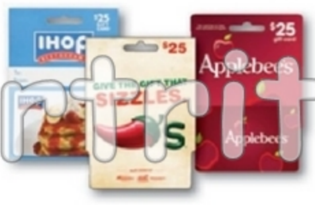
Select Restaurant Gift Cards

GET 10 00 +UP REWARD WHEN YOU BUY $50 OF SELECT GIFT CARDS *Limit 2 +UP offers per household.