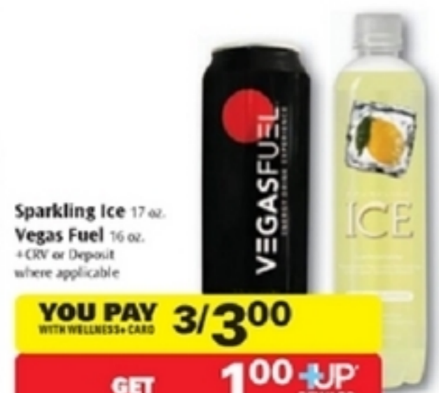
Sparkling Ice 17 oz. Vegas Fuel 16 oz. +CRV or Deposit where applicable

YOU PAY 5/4 00 WITH WELLNESS+ CARD SINGLE PURCHASE PRICE $5.00 GET 2 00 +UP REWARD WHEN YOU BUY 5 OF THESE ITEMS *Limit 2 +UP offers per household.