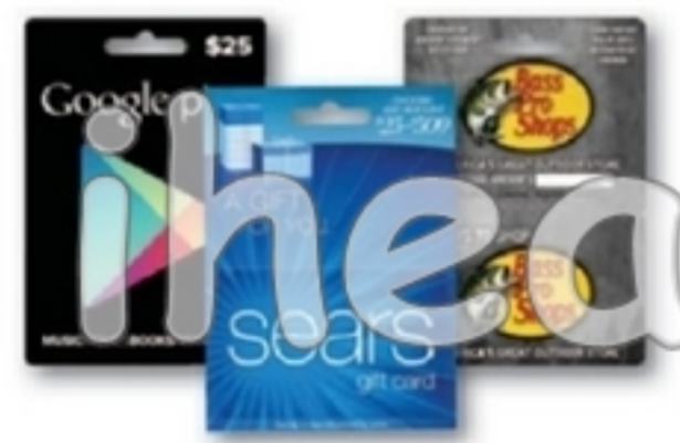
Select Gift Cards

GET 10 00 +UP REWARD WHEN YOU BUY EITHER OF THESE ITEMS *Limit 2 +UP offers per household.