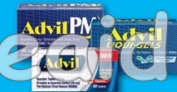
Advil Film Coated Tablets or Caplets or Liqui-Gels 80 ct., Advil PM 40 ct.