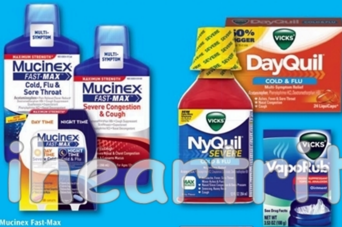
Mucinex Fast-Max Liquid 9 oz. or Caplets 30 ct.