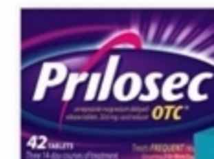
Prilosec OTC 42 ct. or Prevacid 24 Hour 42 ct.