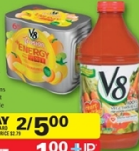
V8 Vegetable Juice 46 oz., Splash 64 oz. or Vfusion Energy 6 Pack, 8 oz. Cans +CRV or Deposit where applicable

YOU PAY 2/6 00 WITH WELLNESS+ CARD SINGLE PURCHASE PRICE $3.49 GET 100+ UP REWARD WHEN YOU BUY 2 OF THESE ITEMS *Limit 4 +UP offers per household.