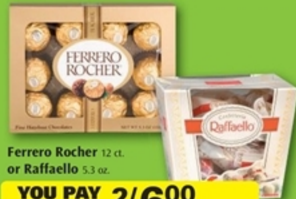
Ferrero Rocher 12 ct. or Raffaello 5.3 oz.

YOU PAY 2/7 00 WITH WELLNESS+ CARD SINGLE PURCHASE PRICE $3.99 LESS MANUFACTURER'S COUPON IN MOST SUNDAY PAPERS -1.00 ON 2 GET 100+ UP REWARD WHEN YOU BUY 2 OF THESE ITEMS *Limit 4 +UP offers per household.