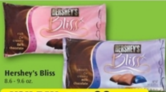
Hershey's Bliss 8.6 - 9.6 oz.

YOU PAY 2/7 00 WITH WELLNESS+ CARD SINGLE PURCHASE PRICE $3.99 LESS MANUFACTURER'S COUPON IN MOST SUNDAY PAPERS -1.00 ON 2 GET 100+ UP REWARD WHEN YOU BUY 2 OF THESE ITEMS *Limit 4 +UP offers per household.