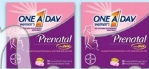
Complete Prenatal multivitamin that provides 100% daily value of Folic Acid

*This statement has not been evaluated by the Food and Drug Administration. This product is not intended to diagnose, treat, cure, or prevent any disease.