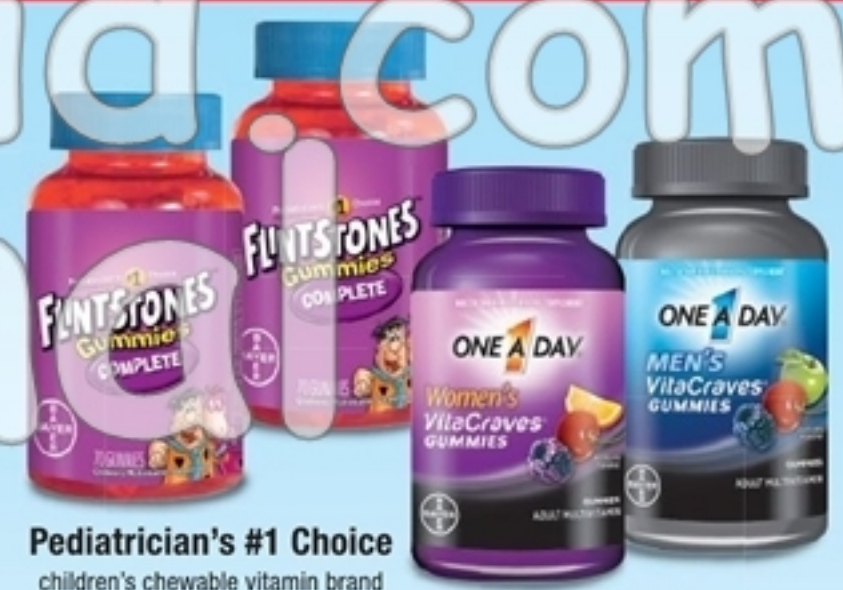
Pediatrician's #1 Choice children's chewable vitamin brand

All One A Day, Flintstones, Citracal, TruBiotics, Phillips' Colon Health and Berocca