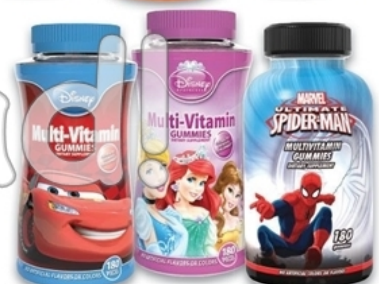
All Disney Vitamins

+UP REWARDS LOAD DIRECTLY TO YOUR WELLNESS+ CARD AND MAY BE REDEEMED AFTER 6AM THE DAY AFTER ISSUANCE. SEE BACK PAGE FOR ADDITIONAL RESTRICTIONS.