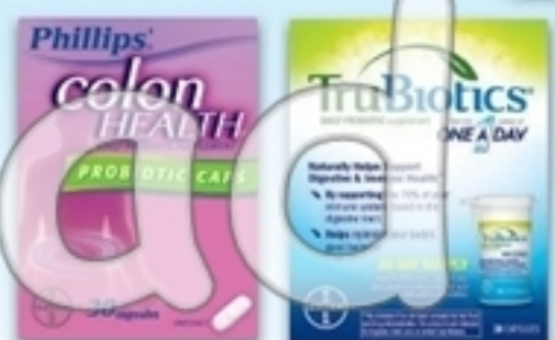
Support Digestive Health*