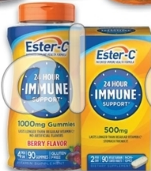
All Ester-C Products