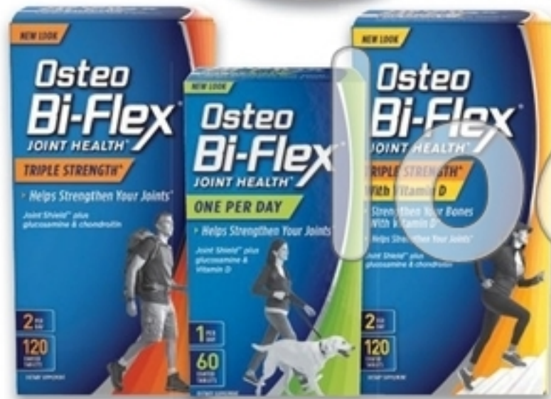
Osteo Bi-Flex (excludes Osteo Edge)