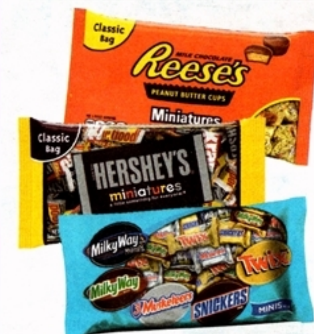
Dove, Hershey's or Mars Miniatures 7.94 - 12 oz.