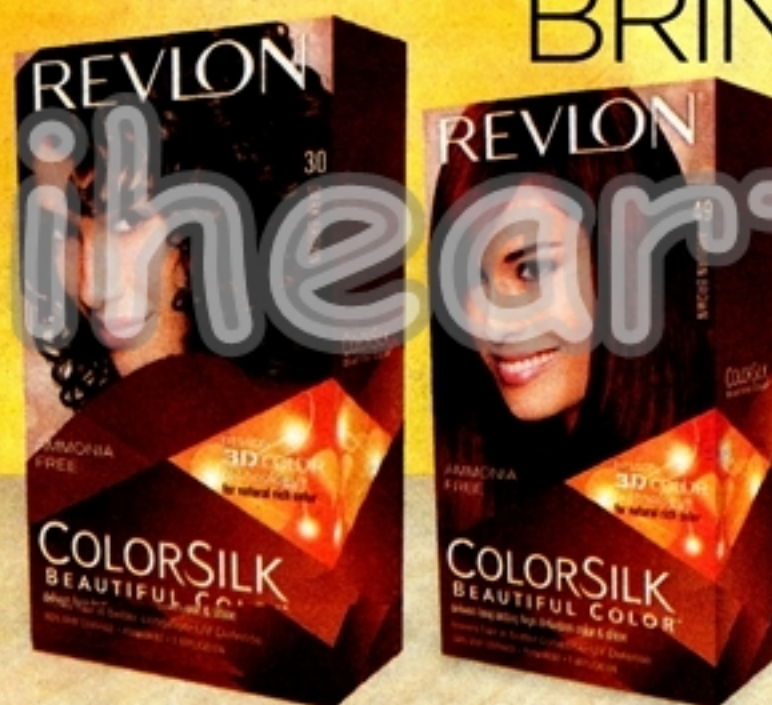
Revlon ColorSilk Hair Color (excludes Buttercream)