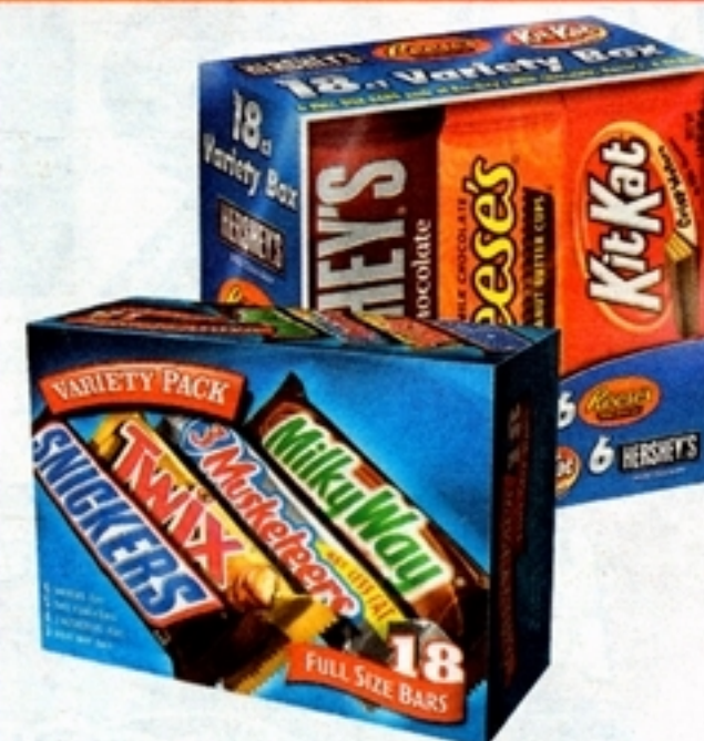
Hershey's or Mars Variety Packs 18 ct.