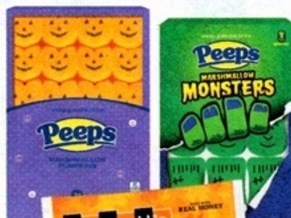
Brach's Candy Corn 8-9 oz. Select Halloween Peeps 9-24 ct.