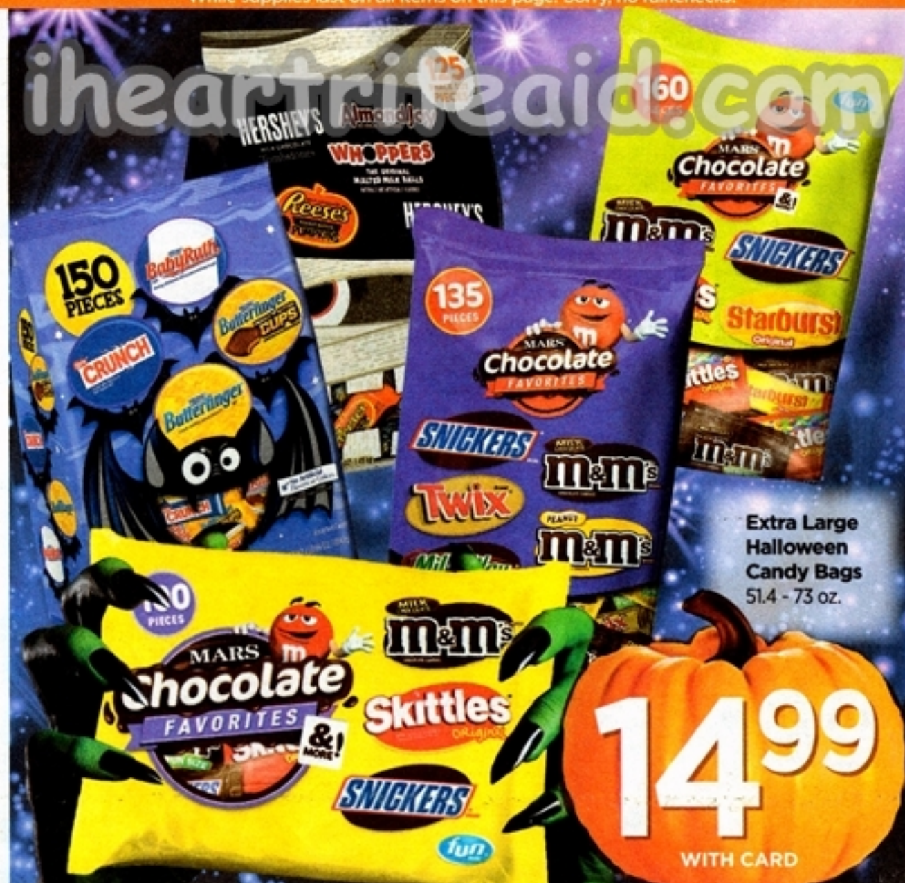
Extra Large Halloween Candy Bags 51.4 - 73 oz.