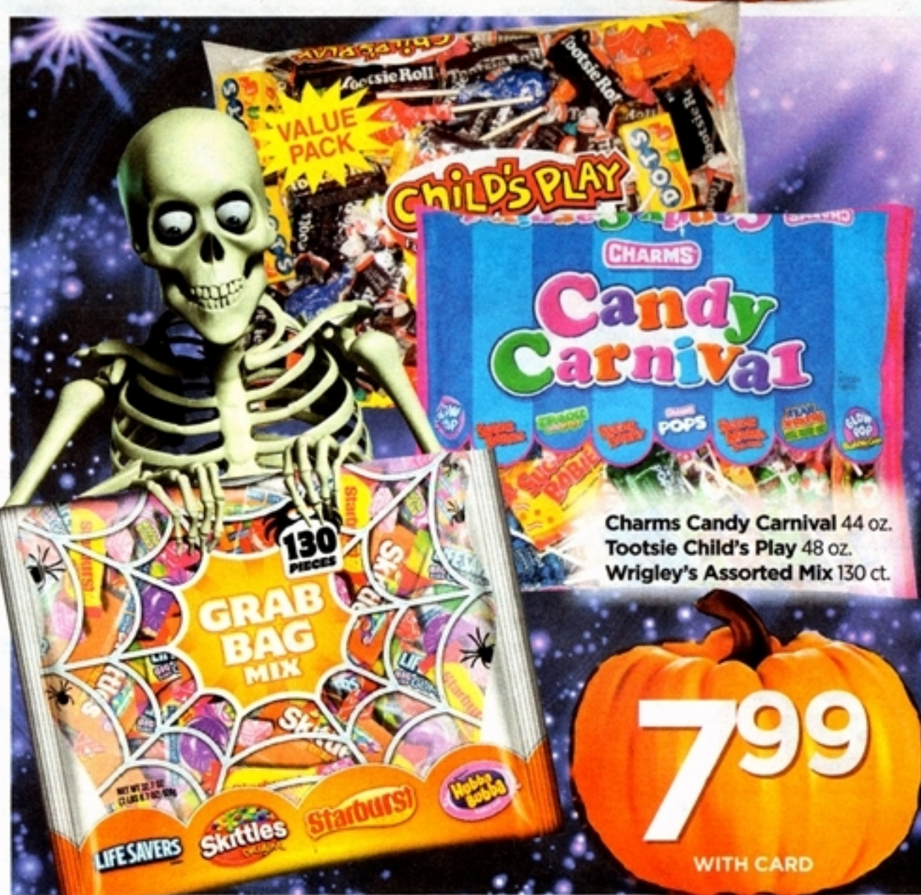
Charms Candy Carnival 44 oz. Tootsie Child's Play 48 oz. Wrigley's Assorted Mix 130 ct.