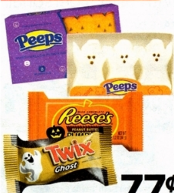
Single Serve Halloween Candy

While supplies last on all items on this page. Sorry, no rainchecks.