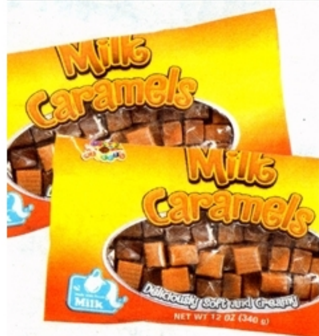
Milk Caramels 12 oz.