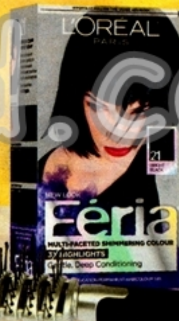
L'ORÉAL Féria Hair Color (excludes Ombre)