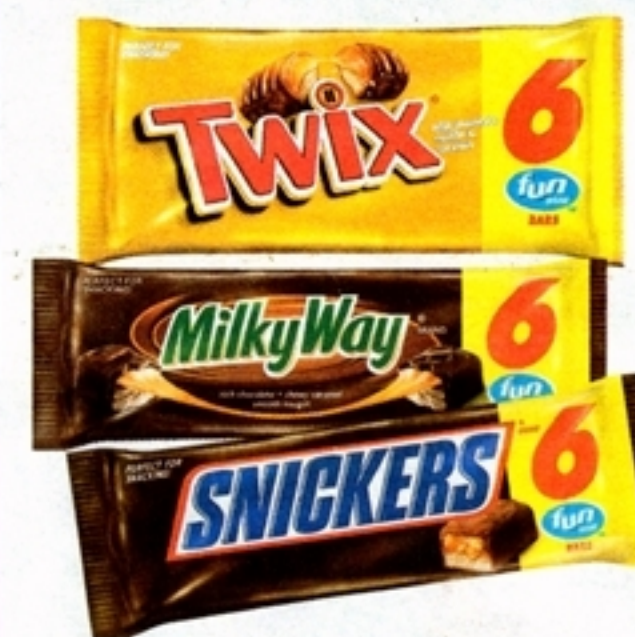
Mars Brand 6 Pack Candies