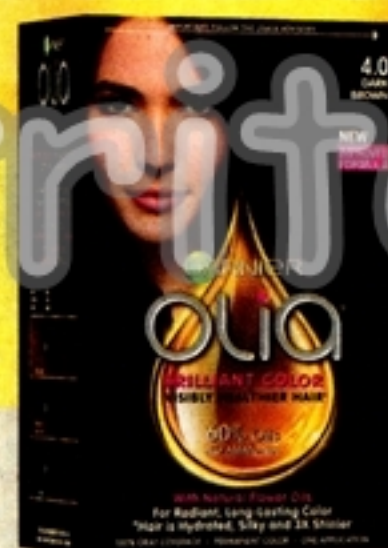
Garnier Olia Hair Color