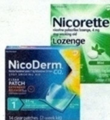
Nicorette Gum 100 - 110 ct. or Lozenges 72 - 81 ct. NicoDerm CQ 14 ct.

Buy 1 Get 1 50% OFF EQUAL OR LESSER VALUE WITH CARD