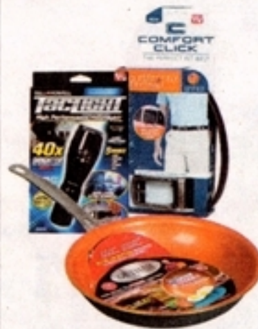
TacLight, Comfort Click Belt or Gotham Steel Pan