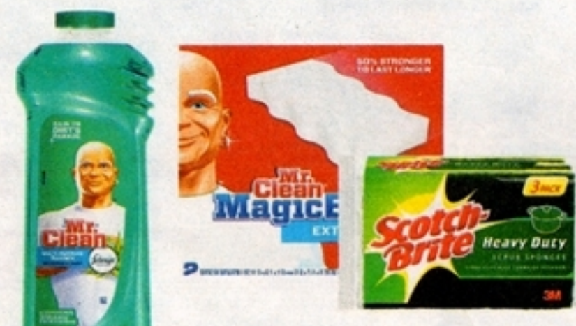
Mr. Clean Liquid 24 oz. or Magic Eraser 2 ct. Murphy Oil Soap 16 oz. or Soft Scrub 24 oz. Scotch Brite Scrub Sponge 3 Pack