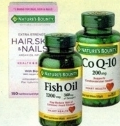
All Nature's Bounty Vitamins and Supplements

Buy 1 Get 1 FREE EQUAL OR LESSER VALUE WITH CARD