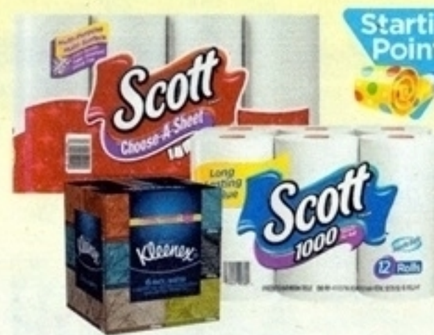
Scott Bath Tissue 12 Pack, Scott Paper Towels 8 Pack, Cottonelle Bath Tissue 18 Pack, Kleenex 6 Pack