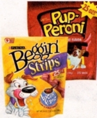
Select Dog Treats