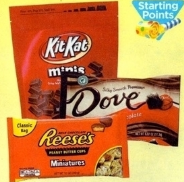
Dove, Mars and Hershey's Miniatures 7.94 - 12 oz. Resealable Chocolate Candy Pouches 5 - 12 oz.