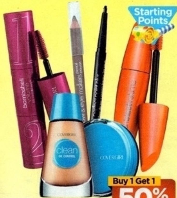
All Covergirl Cosmetics (excludes Clearance Items)

Buy 1 Get 1 50% OFF EQUAL OR LESSER VALUE WITH CARD