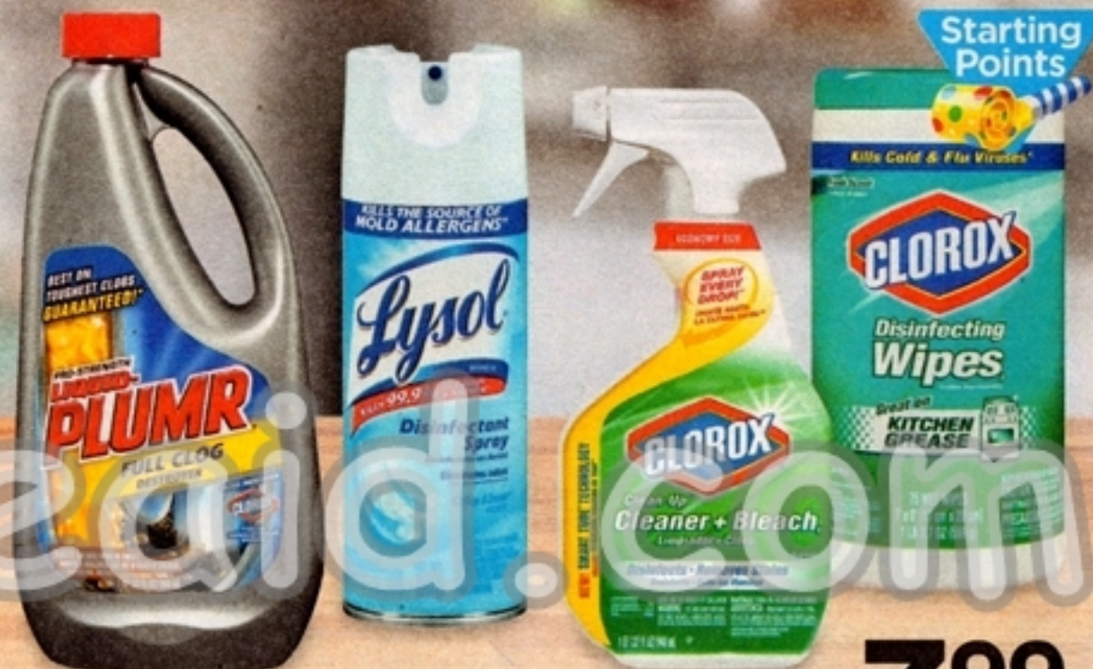
Clorox Clean up Spray 32 oz. or Wipes 75 ct. Lysol Disinfecting Spray 12.5 oz. Liquid Plumr 16 - 32 oz.