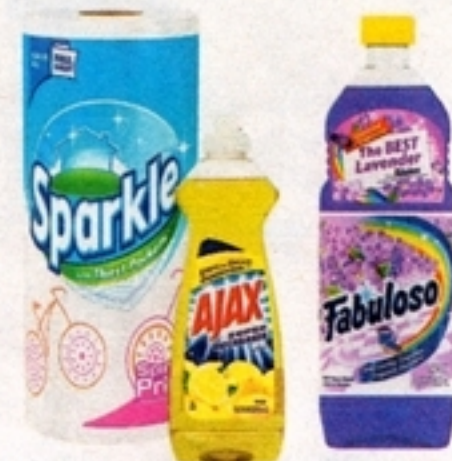
Ajax Cleanser 14 oz. Ajax Dish Liquid 12.6 oz., Fabuloso 22 oz. Sparkle Paper Towel Single

Buy 1 Get 1 FREE EQUAL OR LESSER VALUE WITH CARD