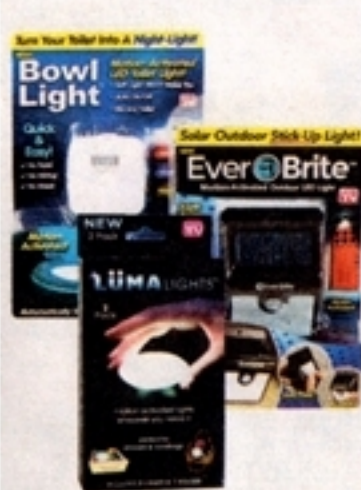
Bowl Light, Ever Brite or Luma Lights