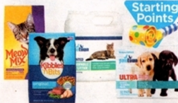
Pawtown Ultra Puppy Pads 32 ct., Cat Litter 9 or 14 lb., Kibbles N Bits or Meow Mix 3.15 - 3.5 lb.