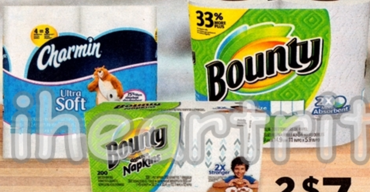
Charmin Bath Tissue 4 Pack, Bounty 2 Roll or Bounty Napkins 200 ct.