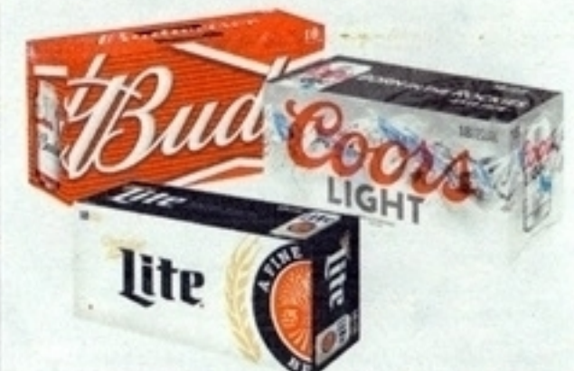
Budweiser, Miller or Coors Beer Select Varieties, 18 Pack, 12 oz. Cans or Bottles