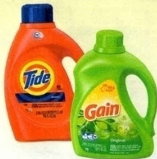
Tide 92 - 100 oz. Gain 100 oz.