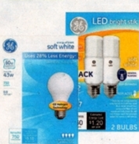
GE Light Bulbs LED 1 pack, Bright Stik LED 2 pack, Soft White Halogen 4 pack or Reveal Halogen 2 pack

Buy 1 Get 1 FREE EQUAL OR LESSER VALUE WITH CARD