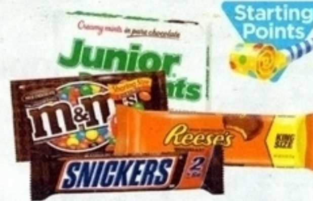
Theater Box, King Size Candy or Mars Brand 6 Pack Candies or Select Single Pack Gum

39.99 WITH CARD OR 24.99 WITH $15.00 OFF PRINT-AT-HOME ONLINE COUPON Go to riteaid.com/coupons for Print-At-Home Coupon