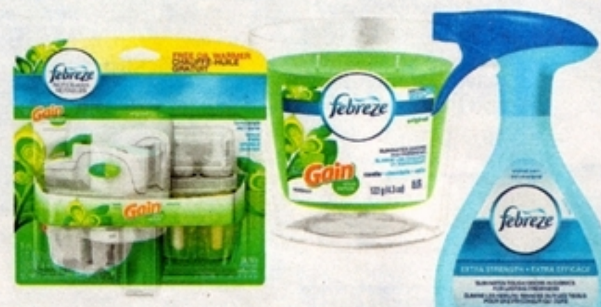
Febreze Spray 800 ml., Candle, Noticeables Single with Warmer Kit, UnStopables 9.7 or 16.9 oz. or Car Vent Clip 2 ct.