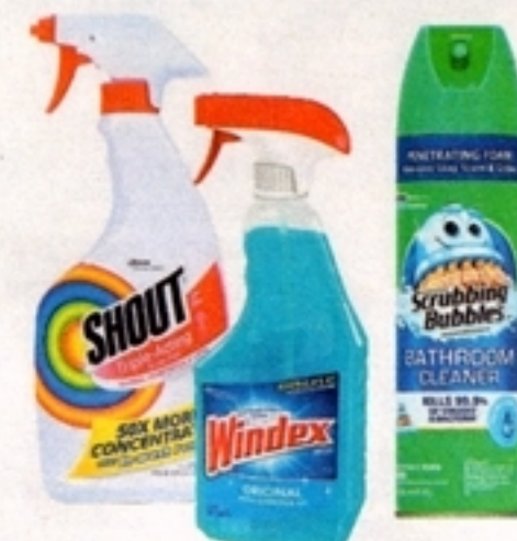
Windex 23 oz. or 28 ct. Wipes, Scrubbing Bubbles 32 oz. Trigger, Aerosol 20 oz., Fantastik 32 oz. or Shout 22 oz.