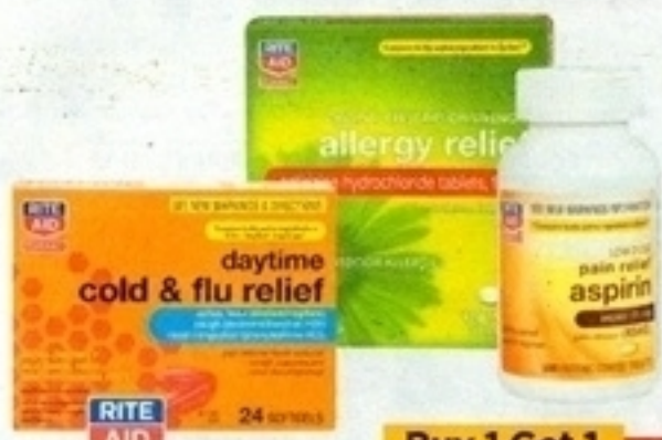
Allergy, Cold and Pain Relief (excludes pseudoephedrine products located at the pharmacy counter.)

**Worth at least $20.00 in savings. Limit 2 offers per card per week. In-store and online purchases at riteaid.com with Plenti card only. 2,000 Plenti points earned for each $50.00 spent on specially marked items. Plenti is a rewards program. Terms and conditions apply. See plenti.com/terms for details.