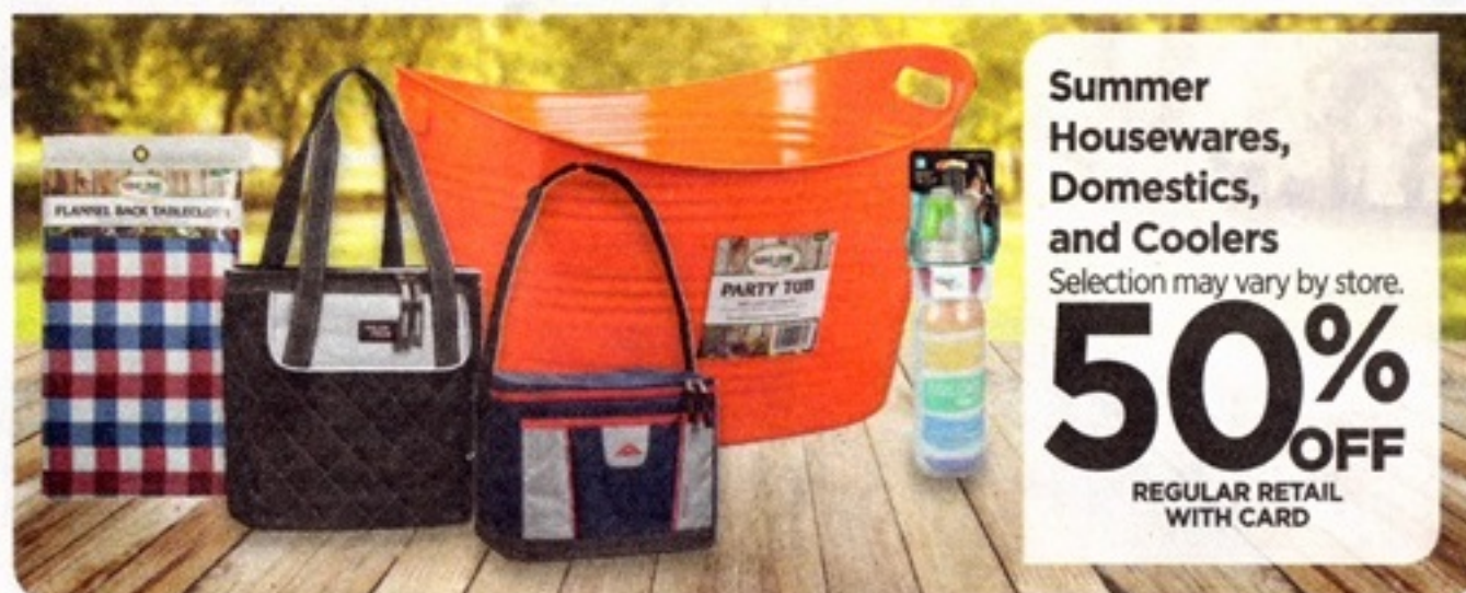
Summer Housewares, Domestics, and Coolers Selection may vary by store.