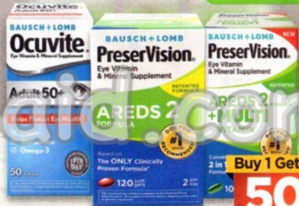
PreserVision and OcuVite Eye Vitamins

Buy 1 Get 1 50% OFF EQUAL OR LESSER VALUE WITH CARD