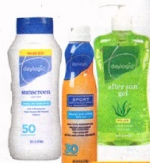
daylogic Sun Care or Sunless Skin Care (excludes Triple Packs)

Buy 1 Get 1 FREE EQUAL OR LESSER VALUE WITH CARD