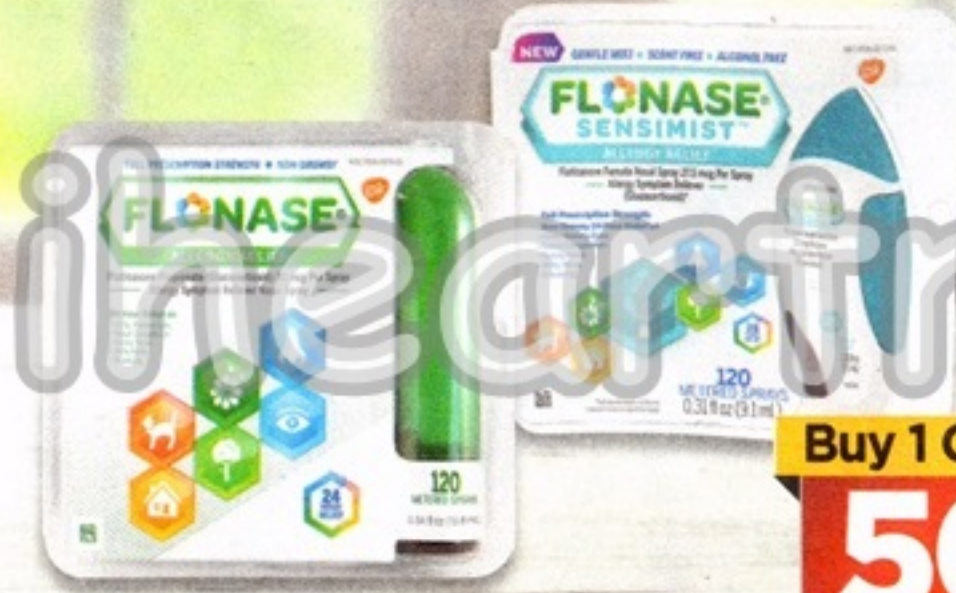
Flonase or Flonase Sensimist Allergy any size

Buy 1 Get 1 50% OFF EQUAL OR LESSER VALUE WITH CARD