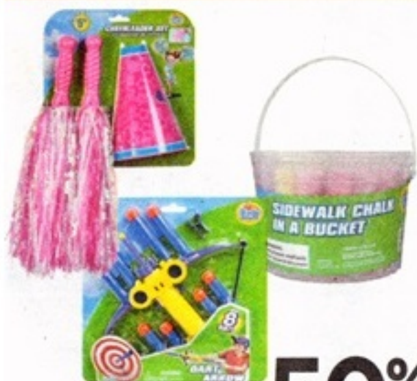
Assorted Summer Toys Selection may vary by store.