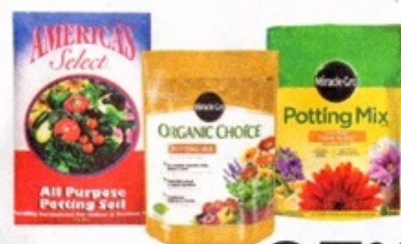
Miracle Gro Potting Mix 8 qt., Jiffy Organic Potting Mix 16 qt. or America's Select Potting Soil 20 lb.

Buy 1 Get 1 FREE EQUAL OR LESSER VALUE WITH CARD