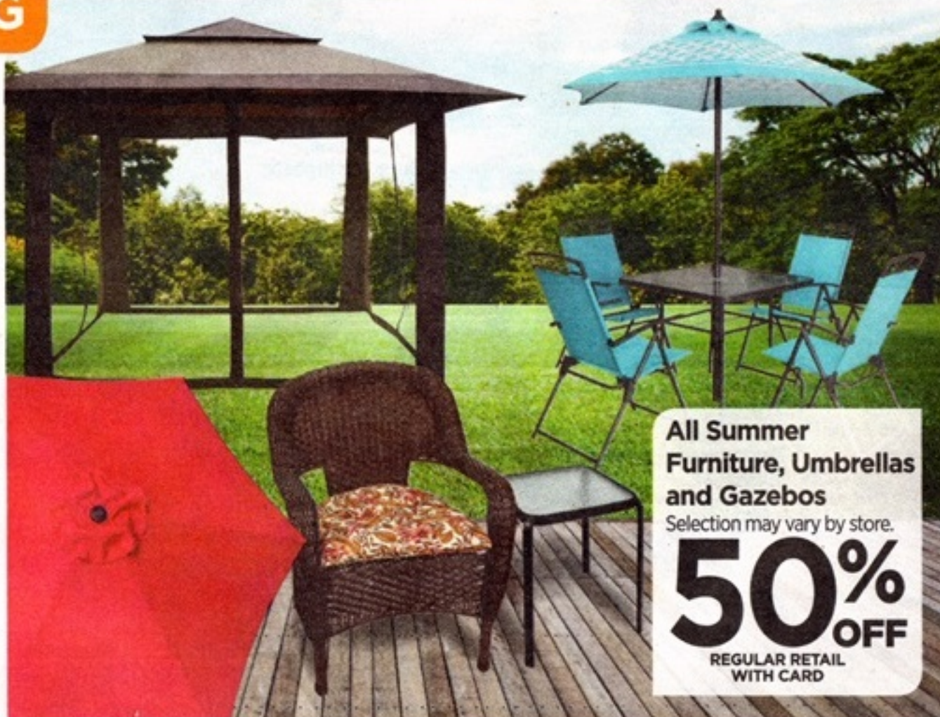
All Summer Furniture, Umbrellas and Gazebos Selection may vary by store.