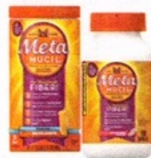
Metamucil 57 or 114 Dose Powder and 160 ct. Caplets

Miralax Products, any size Buy 1 Get 1 50% OFF EQUAL OR LESSER VALUE WITH CARD