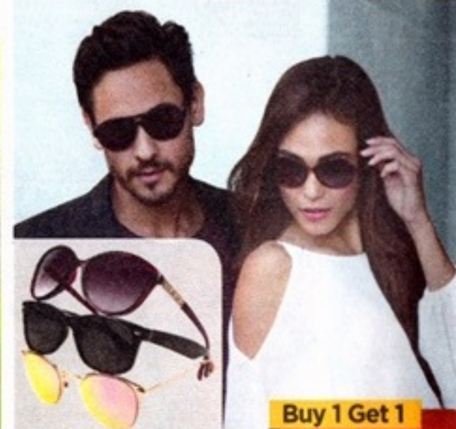
FOSTER GRANT Sunglasses

Buy 1 Get 1 50% OFF EQUAL OR LESSER VALUE WITH CARD