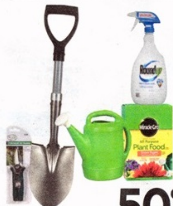
All Garden Tools and Supplies Selection may vary by store.

Buy 1 Get 1 50% OFF EQUAL OR LESSER VALUE WITH CARD