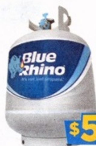
Blue Rhino Propane Exchange 19.99 WITH CARD

$5 wellness+ BonusCash *Limit 2 offers per customer.