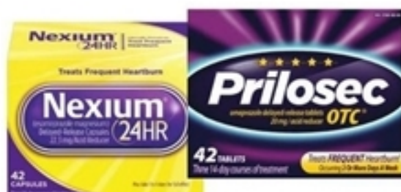
Nexium 24HR or Prilosec OTC 42 ct.