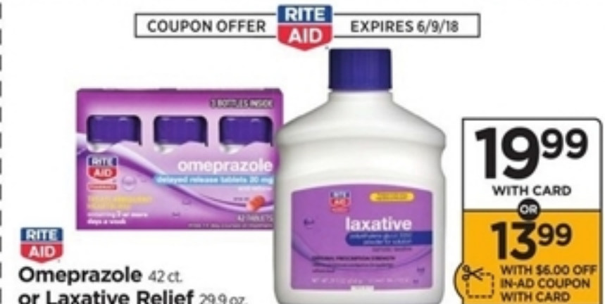
Omeprazole 42 ct. or Laxative Relief 29.9 oz.

Must bring coupon to get advertised discount. Good only at RITE AID Pharmacies. Limit one per customer. Coupon redemption paid by manufacturer. Not valid if duplicated.