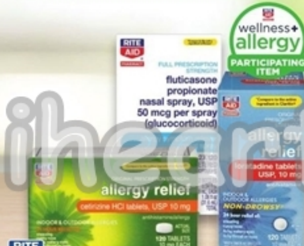
Cetirizine or Loratadine 120 ct., Fexofenadine 90 ct., or Fluticasone 120 Spray Twin Pack