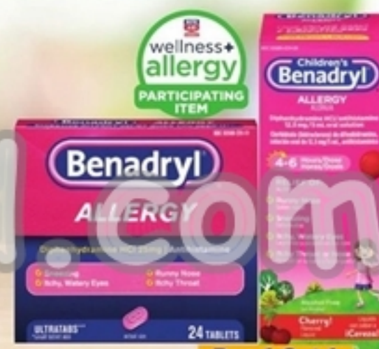
Adult or Children's Benadryl Allergy, any Size

Buy 1 Get 1 50% OFF EQUAL OR LESSER VALUE WITH CARD