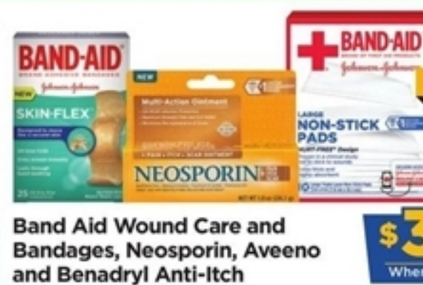
Band Aid Wound Care and Bandages, Neosporin, Aveeno and Benadryl Anti-Itch

$3 wellness+ rewards BonusCash When you buy $15 of these items