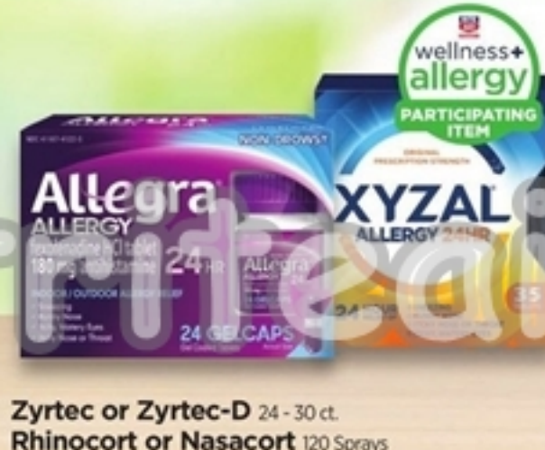
Zyrtec or Zyrtec-D 24 - 30 ct. Rhinocort or Nasacort 120 Sprays Allegra 24 Hr 24 or 30 ct. and Allegra-D 15 - 20 ct. (Zyrtec-D and Allegra-D are located at the pharmacy counter, not available in all states. Limit 1 Zyrtec-D or Allegra-D per customer.)