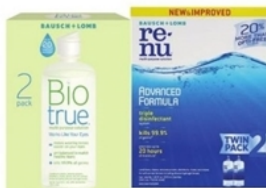
Biotrue, Renu Advanced, or Alaway Twin Packs