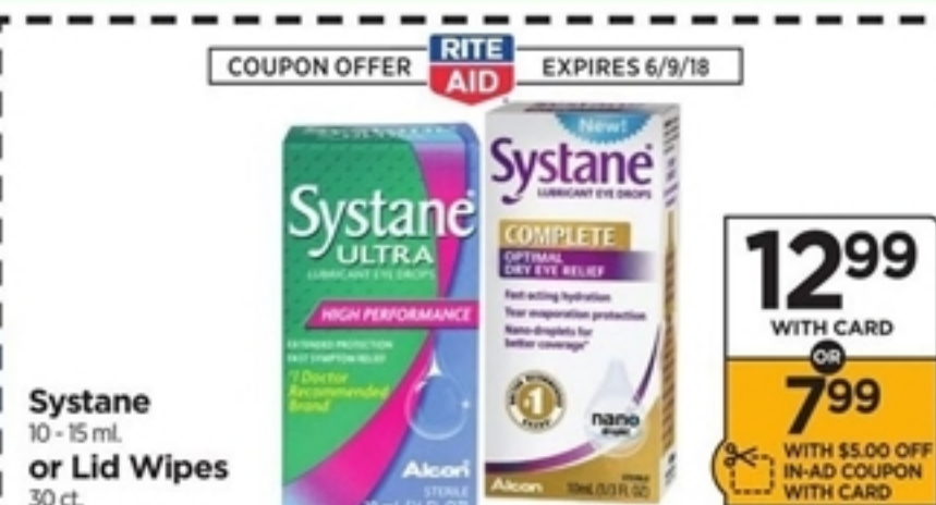
Systane 10 - 15 ml. or Lid Wipes 30 ct.

12 99 WITH CARD OR 7 99 WITH $5.00 OFF IN-AD COUPON WITH CARD