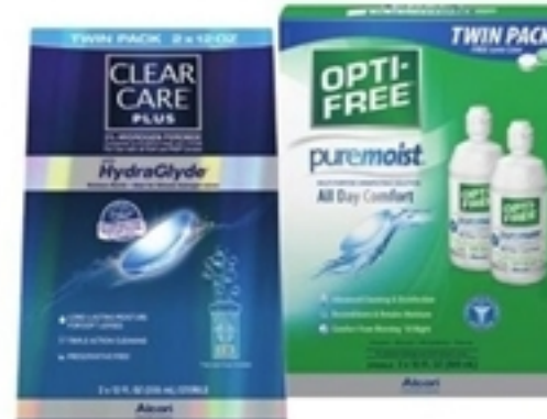
Clear Care or Opti-Free Puremoist Twin Packs