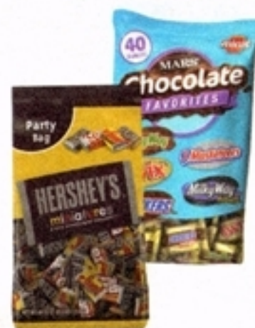
Select Club Size Candy Bags

2 $5 FOR WITH CARD OR 2.99 EA. WITH CARD