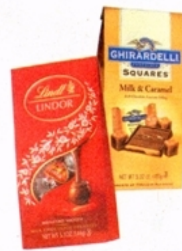
Lindt or Ghirardelli Pouches 4.12 - 5.32 oz.

2 $8 FOR WITH CARD OR 4.49 EA. WITH CARD