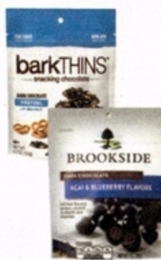
Select Chocolate Pouches from Hershey's, Mars and Nestlé 4.7 - 10.5 oz.

2 $3 FOR WITH CARD OR 1.79 EA. WITH CARD