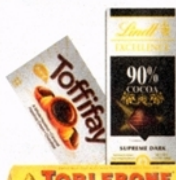
Lindt, Ghirardelli or Select Premium Chocolate Bars 3.17 - 4.4 oz. Toffifay 12 Piece Box

2 $5 FOR WITH CARD OR 2.99 EA. WITH CARD