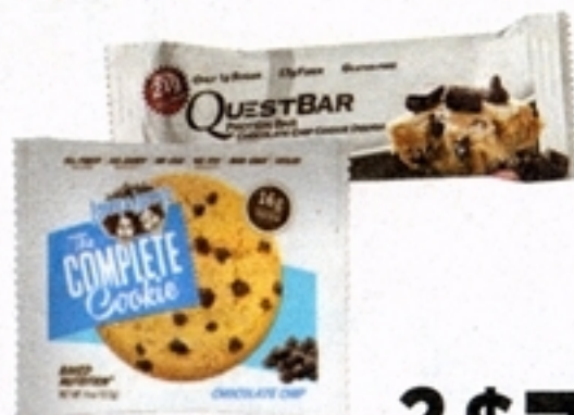
Power Crunch, Lenny & Larry's or Special K Single Nutritional Bars

2 $8 FOR WITH CARD OR 4.49 EA. WITH CARD