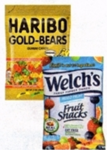
Non-Chocolate Peg Candies Select Varieties

2 $3 FOR WITH CARD OR 1.79 EA. WITH CARD