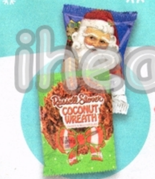
Russell Stover Holiday Singles 0.875 - 1 oz.

3 99¢ FOR WITH CARD OR 59¢ EA. WITH CARD