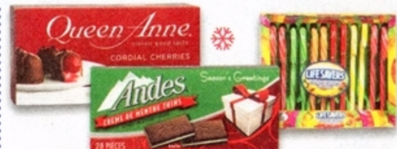
Andes Candies Queen Anne 6.6 oz. Specialty Candy Canes

2 $6 FOR WITH CARD OR 3.49 EA. WITH CARD