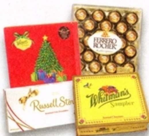
Russell Stover or Dove Boxed Chocolates 23.4 - 26 oz. Ferrero Rocher 24 Piece Whitman's Sampler 24 oz. or Ghirardelli XL Bags 13.15 - 15.11 oz.