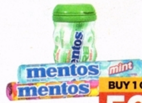
Mentos Gum and Mints

BUY 1 GET 1 50% OFF EQUAL OR LESSER VALUE WITH CARD