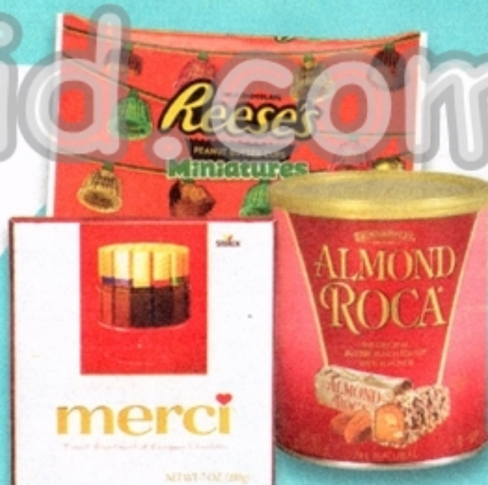
Almond Roca 10 oz. Hershey's Holiday Bags 18.5 oz. Lindt Seasonal Candies 5.9 - 8.5 oz. Merci Chocolates 7 oz. Reese's Tree 6 Pack

2 $2 FOR WITH CARD OR 1.29 EA. WITH CARD