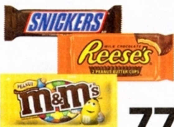
Single Serve Candy

2 $4 FOR WITH CARD OR 2.29 EA. WITH CARD