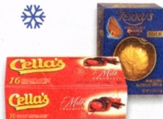
Terry's Oranges, Cella's Cherries 8 oz. Russell Stover Santas 6 Pack or Ribbon Candy 9 oz.

2 $6 FOR WITH CARD OR 3.49 EA. WITH CARD