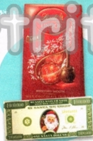
Select Holiday Novelty Candy and Cookies

3 99¢ FOR WITH CARD OR 59¢ EA. WITH CARD