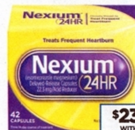
Nexium 24HR 42 ct.

BUY 1 GET 1 50% OFF Equal or Lesser Value WITH CARD