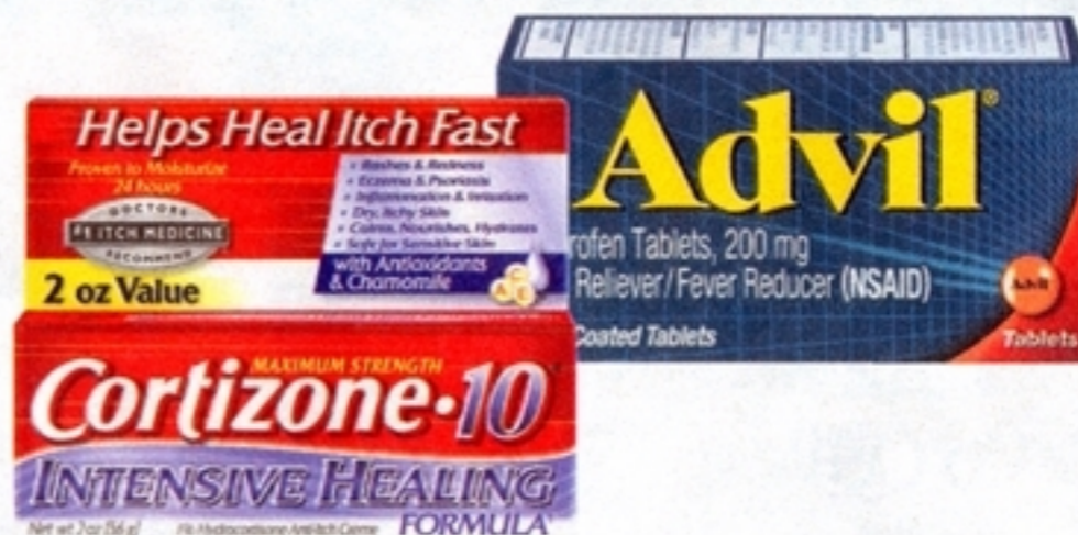
Advil 80 - 100 ct. Advil PM 40 ct. Cortizone-10 2 - 3.5 oz.

$19.99 WITH CARD Also Save Up To $10 off With coupons in most Sunday papers