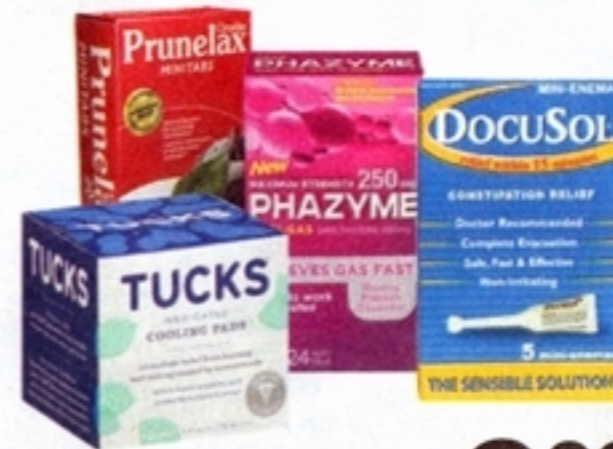
Docusol, Phazyme, Prunelax 60 ct. or Tucks 100 ct.