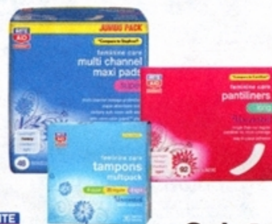
Pads 34, 38, 44 - 48 ct., Liners 92 - 105 ct. or Tampons 36 - 54 ct.

$23.99 WITH CARD Also Get $3 BonusCash *Limit 2 offers per customer