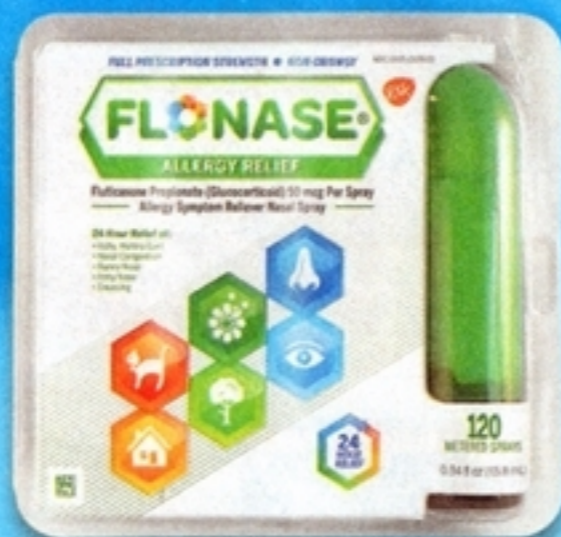
Flonase Allergy Relief 120 Sprays

BUY 1 GET 1 50% OFF Equal or Lesser Value WITH CARD