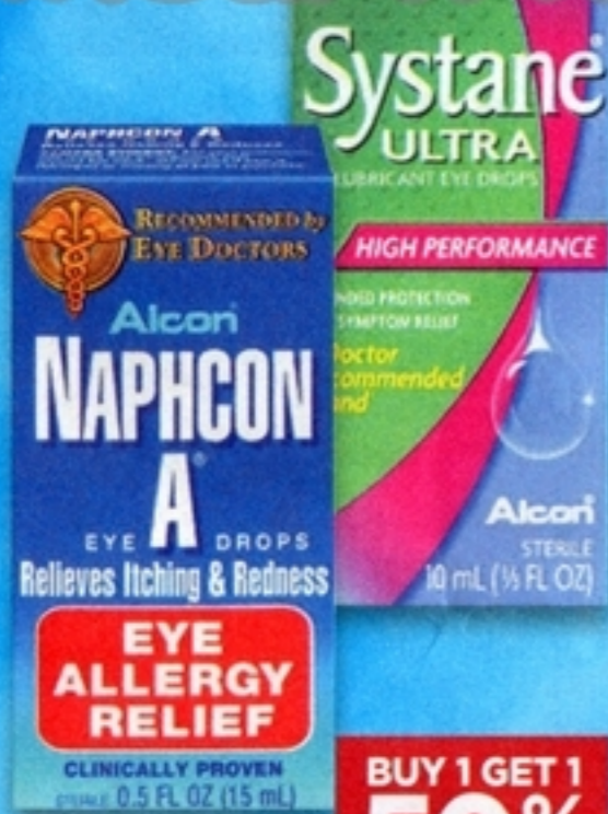
Systane, GenTeal or Naphcon A

BUY 1 GET 1 50% OFF Equal or Lesser Value WITH CARD