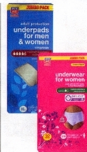
Jumbo Pack Protective Underwear 28 - 32 ct., Bladder Control Pads 45 or 64 ct., Male Guards 72 ct. or Underpads 20 or 36 ct.

2 $11 FOR WITH CARD OR 5.79 EA. WITH CARD