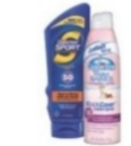
Coppertone Sun Care Products

Also Save $6 off With coupon in most Sunday papers