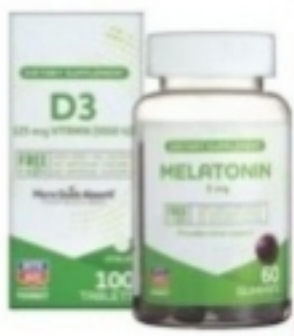
RITE AID Vitamins and Supplements

BUY 1 GET 1 50% OFF Equal or Lesser Value WITH CARD