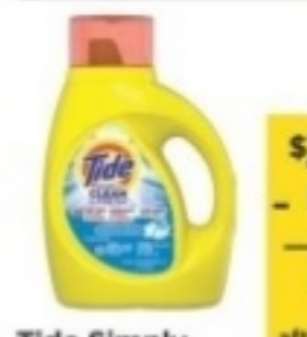
Tide Simply 31 - 34 oz., 13 ct., Downy 34 oz. and Unstopables 4.3 oz. or Bounce Sheets 40 ct.

BUY 1 GET 1 50% OFF Equal or Lesser Value WITH CARD