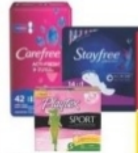
Playtex Tampons, Carefree 36 - 92 ct., Stayfree or o.b. and o.b. Organic Products

Arizona 20 - 23 oz. +CRV or deposit where applicable BUY 1 GET 1 FREE Equal or Lesser Value WITH CARD