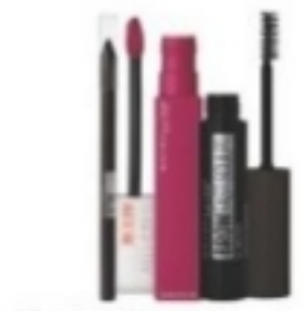
Maybelline Eye and Lip Makeup (excludes Face Makeup)

BUY 1 GET 1 50% OFF Equal or Lesser Value WITH CARD