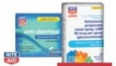
Long Acting Allergy or Digestive Relief Products (excludes Pseudoephedrine (PSE) Containing Products)

Also Get wellness+ rewards $5 BonusCash When you buy $20 of these items.* *Limit 2 offers per customer