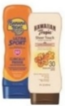
Banana Boat or Hawaiian Tropic (excludes Twin, Stick, Family and Trial Sizes)

Also Get wellness+ rewards $2 BonusCash When you buy 2 of these items.* *Limit 2 offers per customer