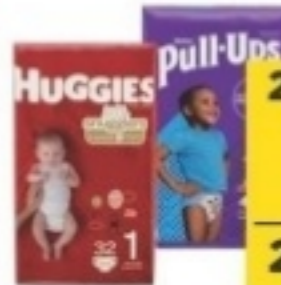
Huggies Jumbo Pack Diapers 15 - 34 ct., Pull-Ups 17 - 25 ct., or GoodNites 11 - 14 ct.

Also Get wellness+ rewards $2 BonusCash When you buy 2 of these items.* *Limit 2 offers per customer