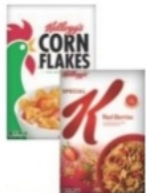
Select Kellogg's Cereal or Bars

BUY 1 GET 1 FREE Equal or Lesser Value WITH CARD