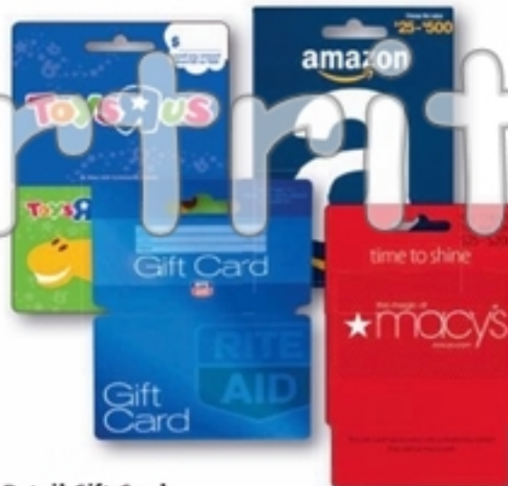
Retail Gift Cards Selection may vary by store