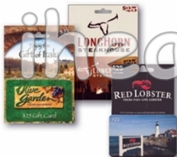
Dining Gift Cards Selection may vary by store

Must bring coupon to get advertised discount. Good only at RITE AID Pharmacies. Limit one per customer. Coupon redemption paid by manufacturer. Not valid if duplicated.