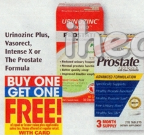
Urinozinc Plus, Vasorect, Intense X or The Prostate Formula

*Worth at least $4 00 in savings. Limit 2 offers per card.