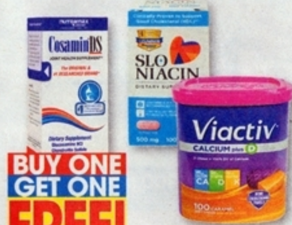
Cosamin DS, ASU, Slo Niacin or Viactiv 100 ct.