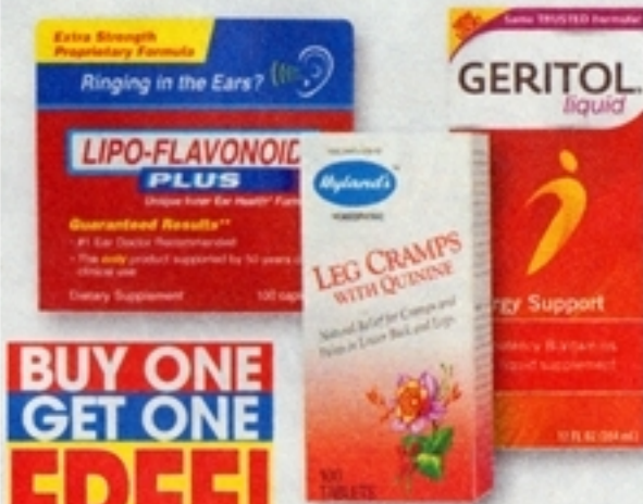
All Lipo-Flavonoid, Geritol or Hyland's