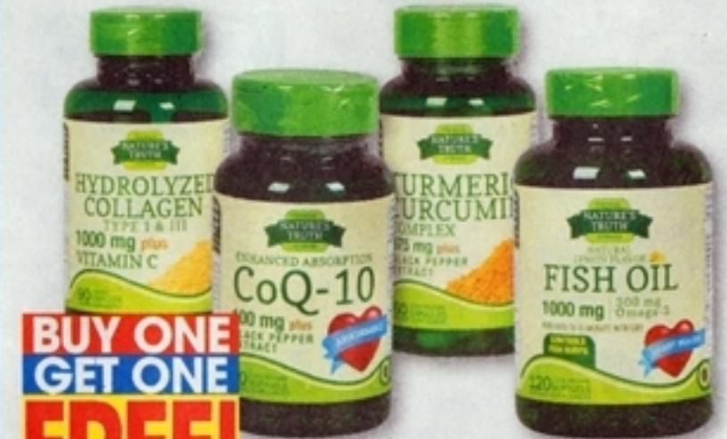
Nature's Truth Vitamins and Supplements