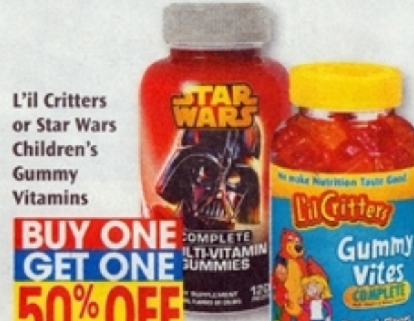
L'il Critters or Star Wars Children's Gummy Vitamins