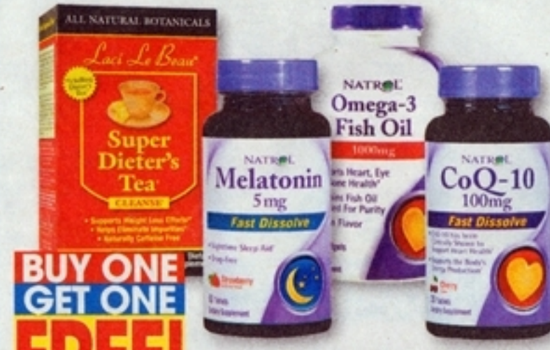
NATROL Supplements and Laci Le Beau Teas