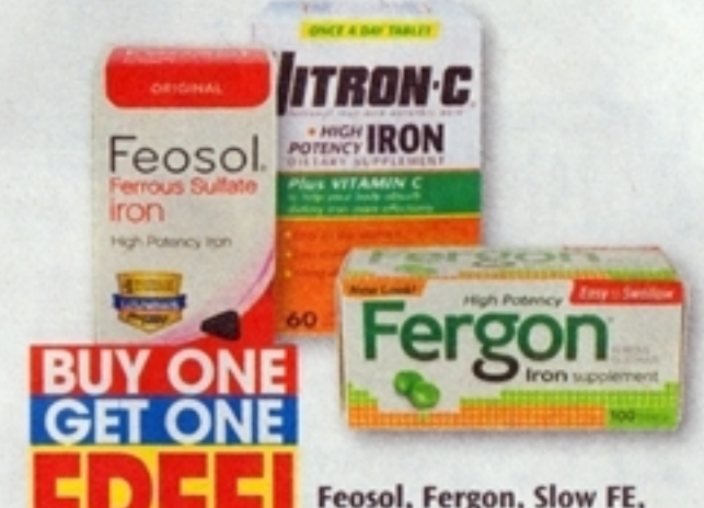
Feosol, Fergon, Slow FE, Vitron-C Iron Supplements or Thermotabs Salt Supplement