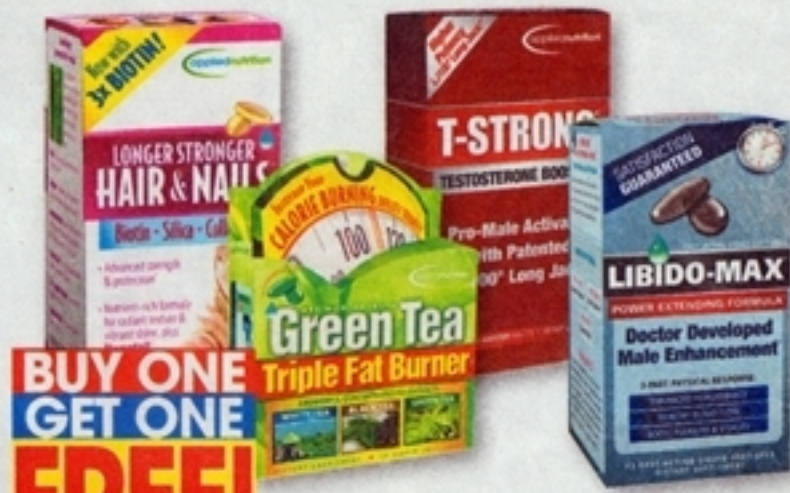
Applied Nutrition Vitamins and Supplements