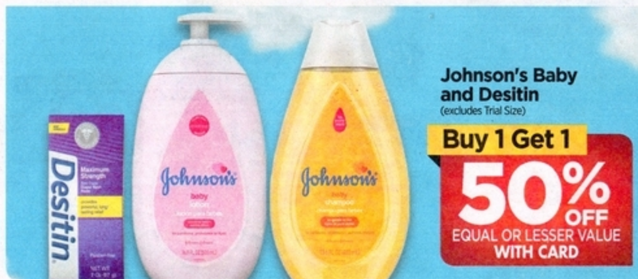
Johnson's Baby and Desitin (excludes Trial Size)

6 99 WITH CARD OR 3 99 WITH $3.00 OFF MANUFACTURER'S COUPON WITH CARD Find this coupon in most Sunday papers