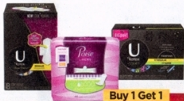
U by Kotex Pads, Tampons, Liners 40 - 150 ct. Poise Pads 20 - 30 ct. or Liners 30 - 54 ct.

2$24 FOR OR 13.99 EA. WITH CARD OR 2$21 FOR WITH $3.00 OFF ON 2 MANUFACTURER'S COUPON WITH CARD Find this coupon in most Sunday papers