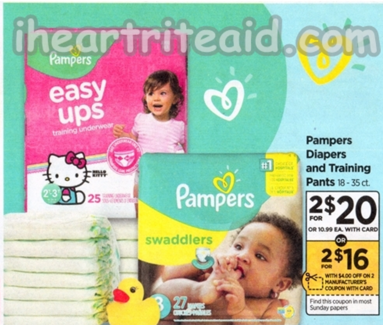
Pampers Diapers and Training Pants 18 - 35 ct.

2$20 FOR OR 10.99 EA. WITH CARD OR 2$16 FOR WITH $4.00 OFF ON 2 MANUFACTURER'S COUPON WITH CARD Find this coupon in most Sunday papers