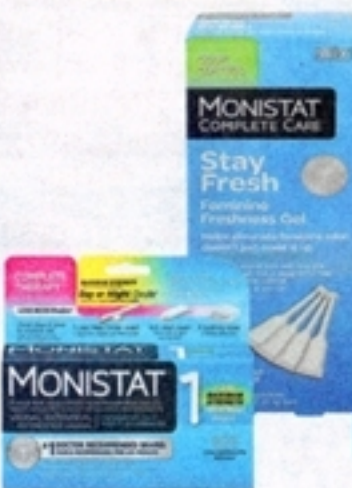
Monistat 1 and 3 Day Treatments and Complete Care

Buy 1 Get 1 50% OFF EQUAL OR LESSER VALUE WITH CARD