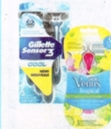
Gillette and Venus Disposable Razors 2 - 12 ct.

$2 wellness+ rewards BonusCash When you buy 2 of these items *Limit 2 offers per customer.