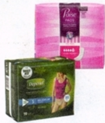
Select Depend and Poise Adult Protection

2$24 FOR OR 13.99 EA. WITH CARD OR 2$21 FOR WITH $3.00 OFF ON 2 MANUFACTURER'S COUPON WITH CARD Find this coupon in most Sunday papers