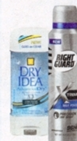
Right Guard Dry Sprays, Sticks, Gels or Dry Idea

Buy 1 Get 1 50% OFF EQUAL OR LESSER VALUE WITH CARD