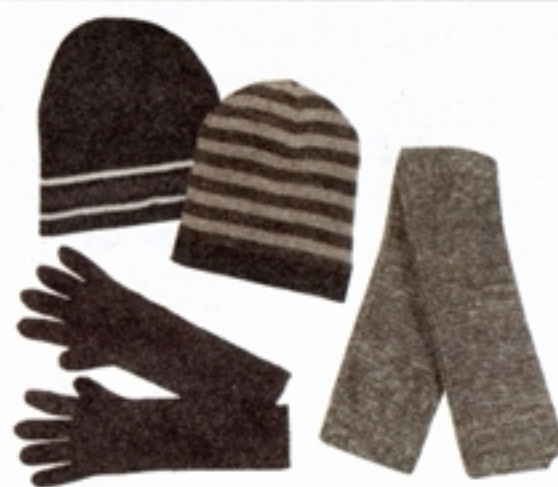
Winter Hats, Gloves and Scarves Selection may vary by store.