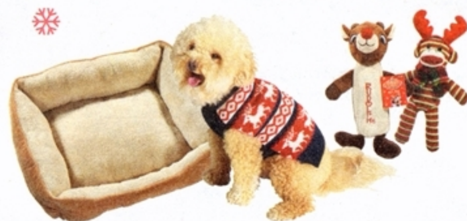
Holiday Clothing and Treats for Your Pet