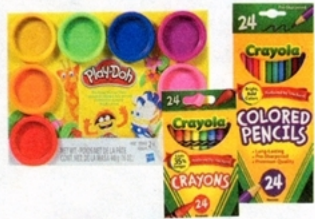
Arts and Crafts Supplies or Activity Sets