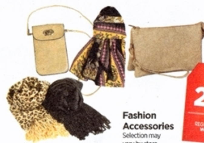
Fashion Accessories Selection may vary by store.