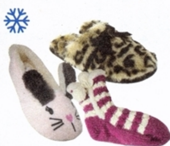
Select Family Footwear (excludes Rite Buy and Clearance items.) Selection may vary by store.