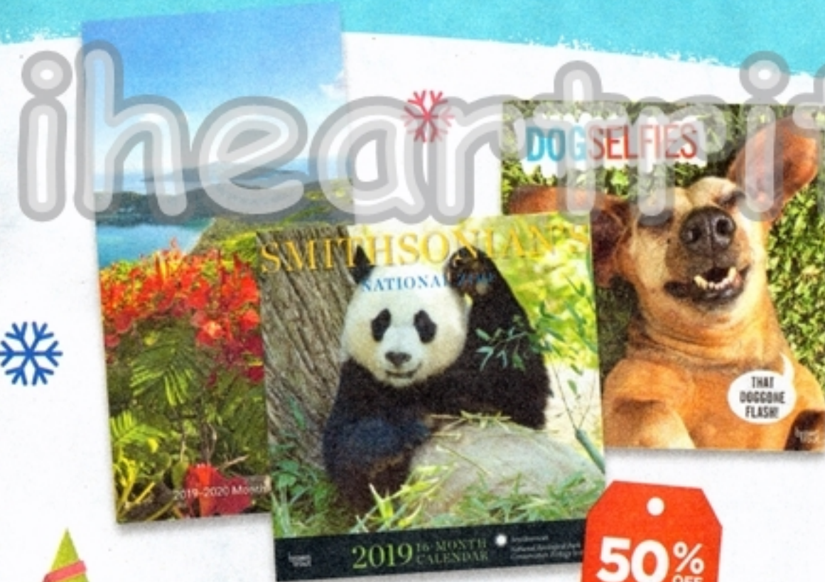
Assorted 2019 Calendars Selection may vary by store.