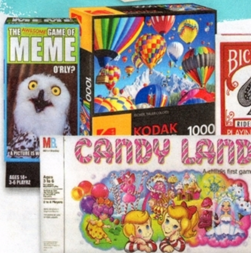
Assorted Games, Puzzles or Playing Cards