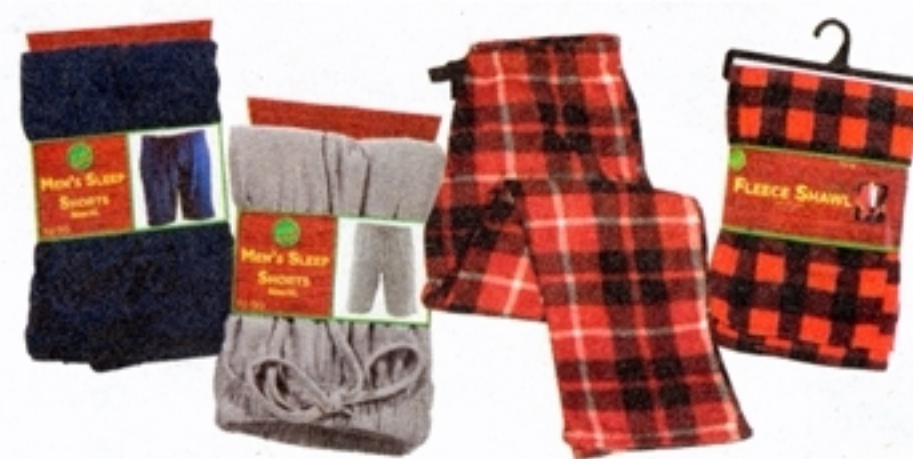
Holiday Apparel Selection may vary by store.