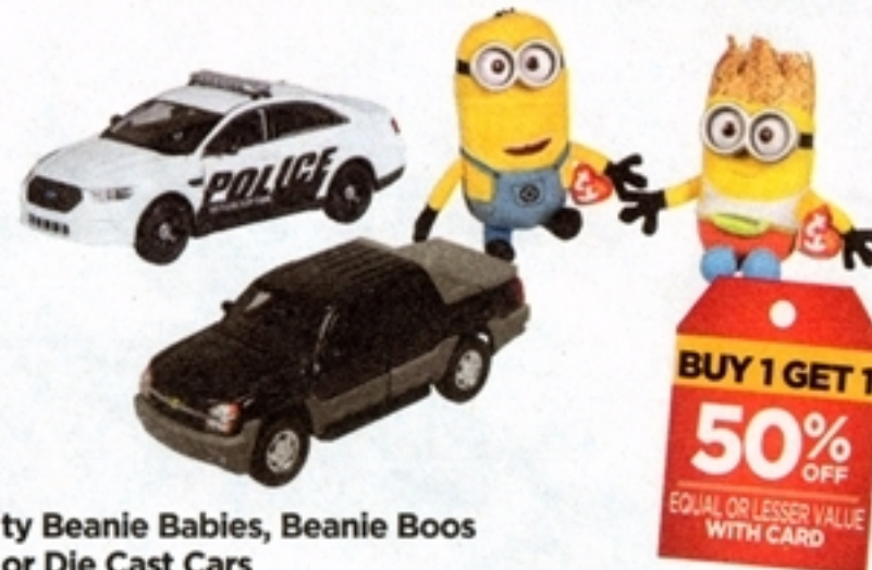
ty Beanie Babies, Beanie Boos or Die Cast Cars