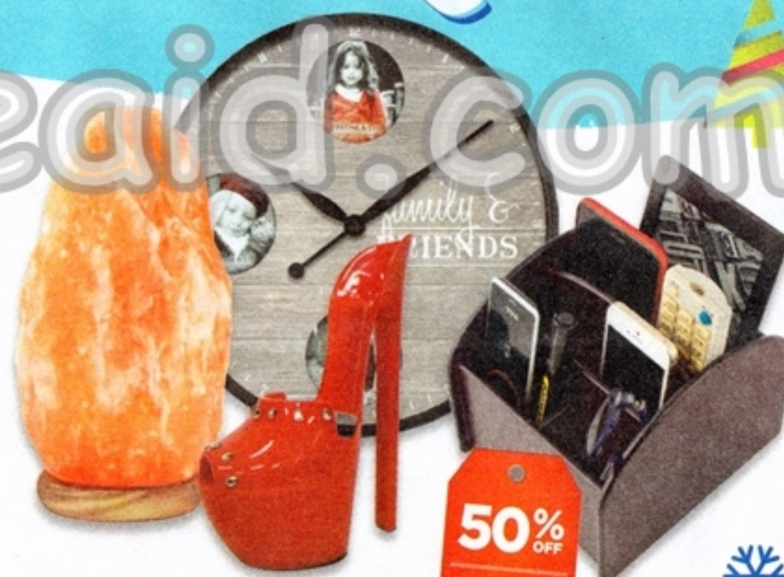
Select Gifts Selection may vary by store.