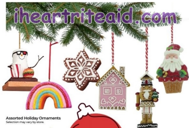
Assorted Holiday Ornaments Selection may vary by store.