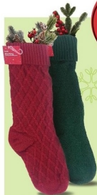
Knit Stocking 20 inches Selection may vary by store.