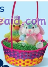
Easter Plush (excludes Cutie Pet-Tudies) Selection may vary by store.